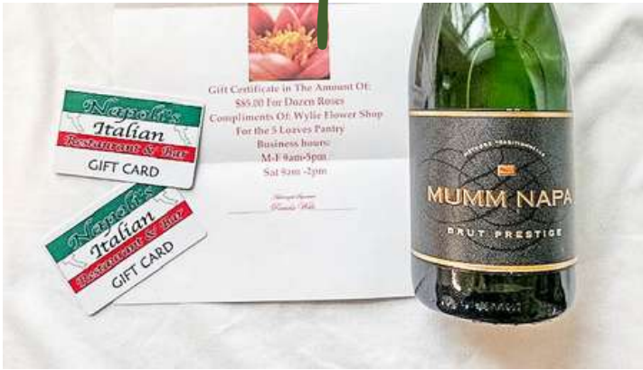
Napoli's Italian Restaurant Gift certificates available for fine Italian dining here in Wylie