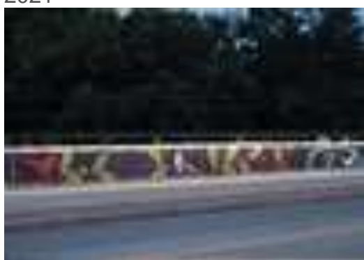
Natural Rhythm 2' x 240' x 1" Artwork for Sale: Yes $60,000.00 2021