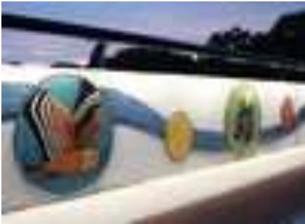
Natural Rhythm 2' x 240' x 1" Artwork for Sale: Yes $60,000.00 2021