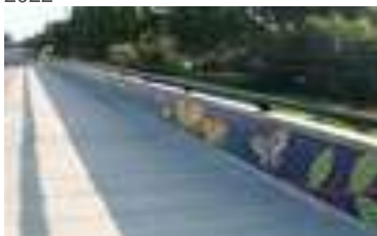
Natural Rhythm 2' x 240' x 1" Artwork for Sale: Yes $60,000.00 2021