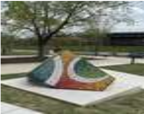
Balance 4' x 7' x 5' Artwork for Sale: Yes $25,000.00 2022