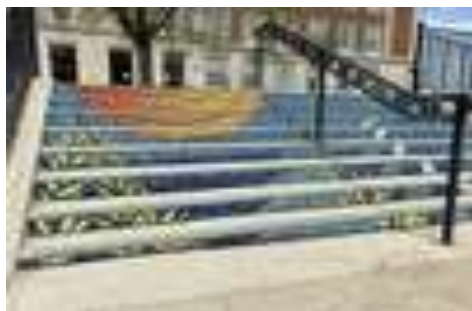
Harmony 6' x 15' x 1" Artwork for Sale: Yes $20,000.00 2022