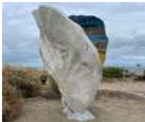
Chryshellis - Left outer shell view