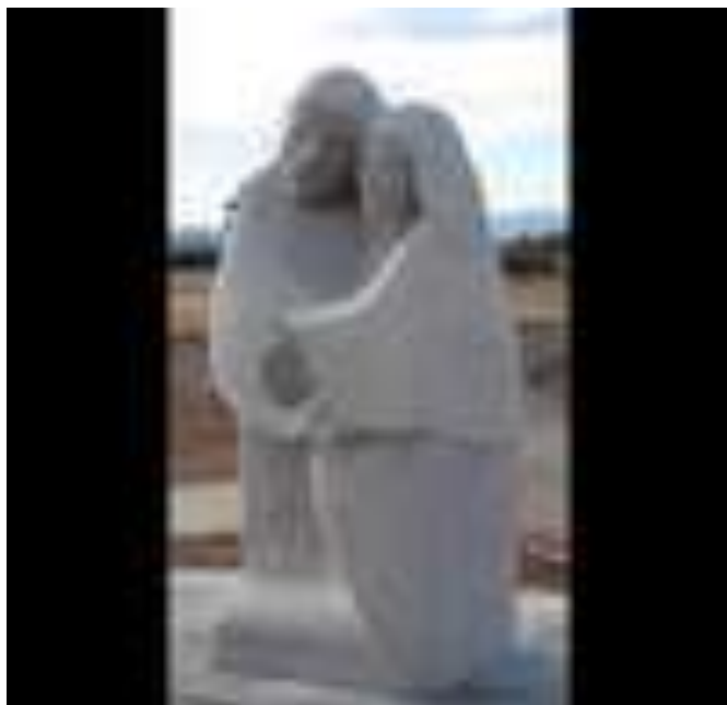
"400 Years" 7' x 3' x 2.5' Artwork for Sale: Yes $150,000.00 2012