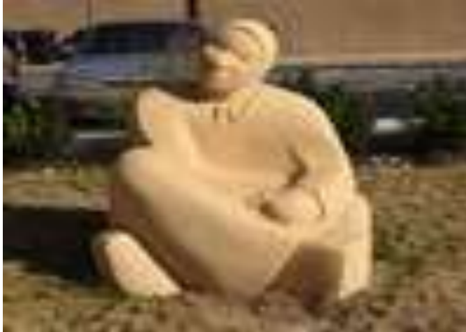
We Were Here