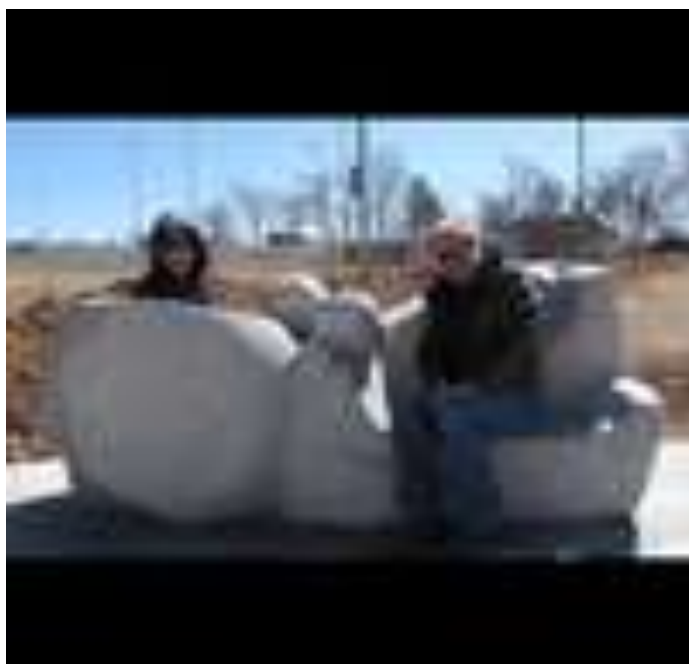
"400 Years" 3.5' x 8' x 3' Artwork for Sale: Yes $150,000.00 2012