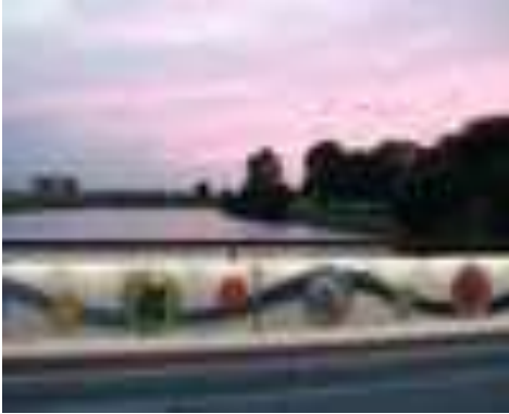
Natural Rhythm 2' x 240' x 1" Artwork for Sale: Yes $60,000.00 2021