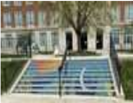
Harmony 6' x 15' x 1" Artwork for Sale: Yes $20,000.00 2022