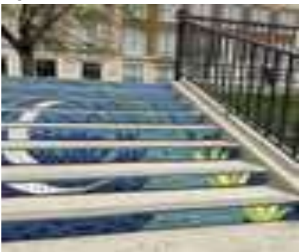
Harmony 6' x 15' x 1" Artwork for Sale: Yes $20,000.00 2022