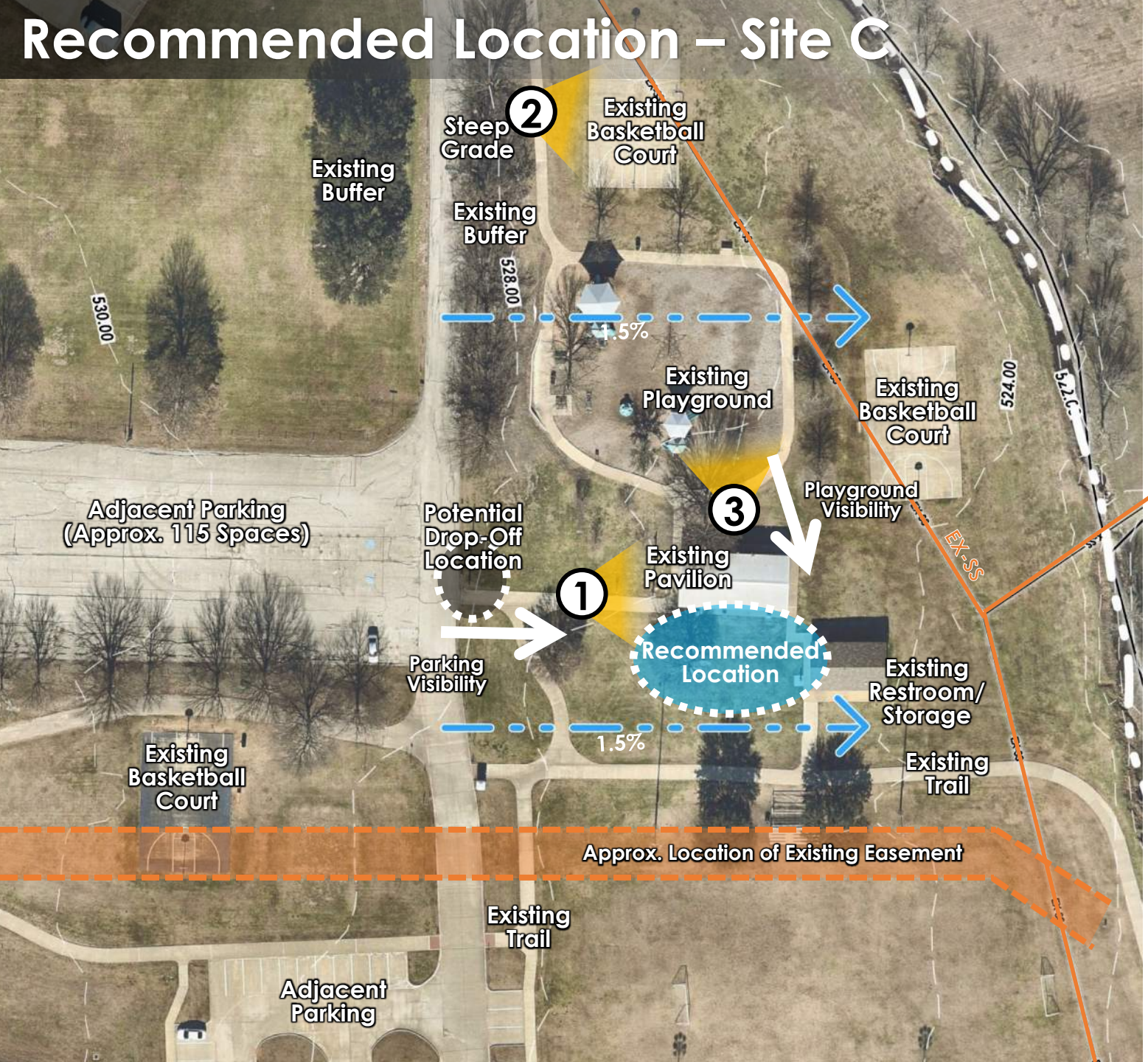
View from Potential Drop-Off ① 05/19/2022 Item DS1.