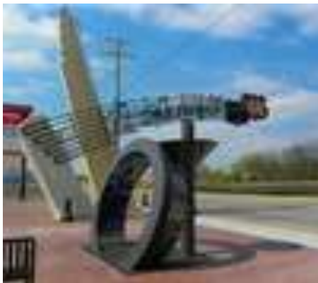
Floating Hanger 01 9.5' x 10' x 5' Artwork for Sale: Yes