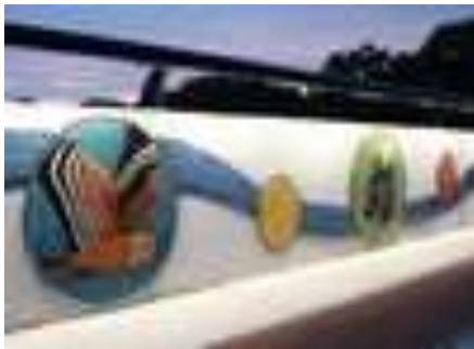
Natural Rhythm 2' x 240' x 1" Artwork for Sale: Yes $60,000.00 2021