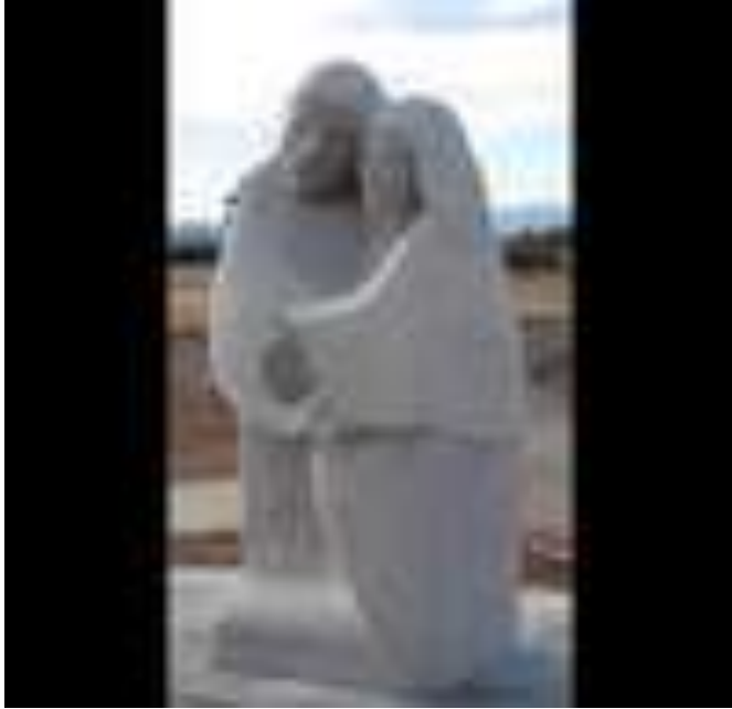
"400 Years" 7' x 3' x 2.5' Artwork for Sale: Yes $150,000.00 2012