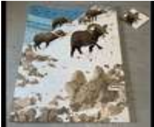
Bighorn Slope 6' x 4' x 2" Artwork for Sale: Yes $8,600.00 2020