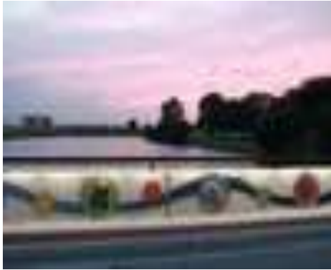
Natural Rhythm 2' x 240' x 1" Artwork for Sale: Yes $60,000.00 2021