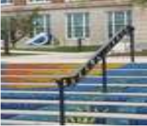
Harmony 6' x 15' x 1" Artwork for Sale: Yes $20,000.00 2022