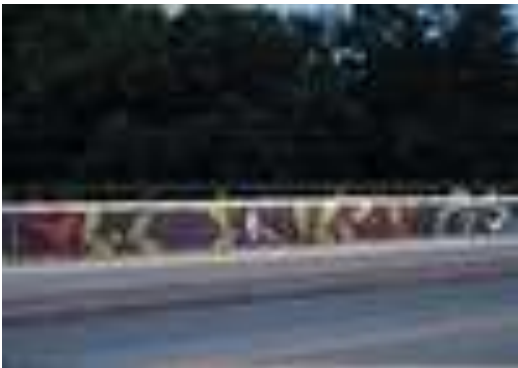
Natural Rhythm 2' x 240' x 1" Artwork for Sale: Yes $60,000.00 2021