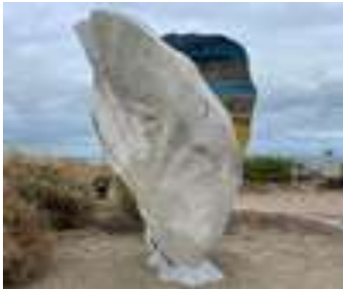
Chryshellis - Left outer shell view