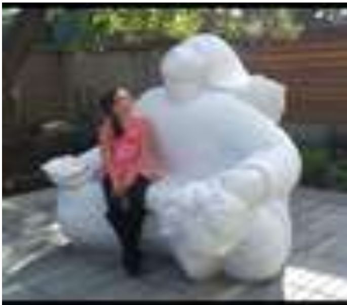
Flower Girl 5' x 5' x 5' Artwork for Sale: Yes $45,000.00 2016