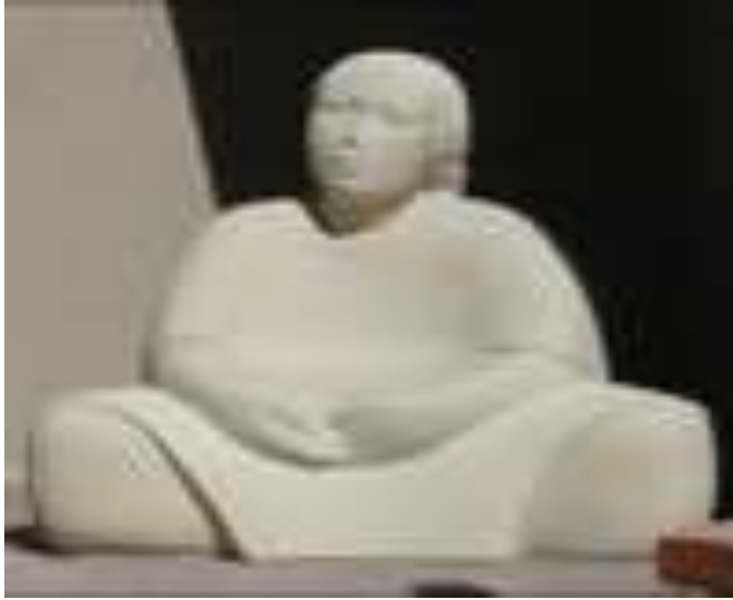
Hope 5' x 5' x 3' Artwork for Sale: Yes $28,600.00 2010