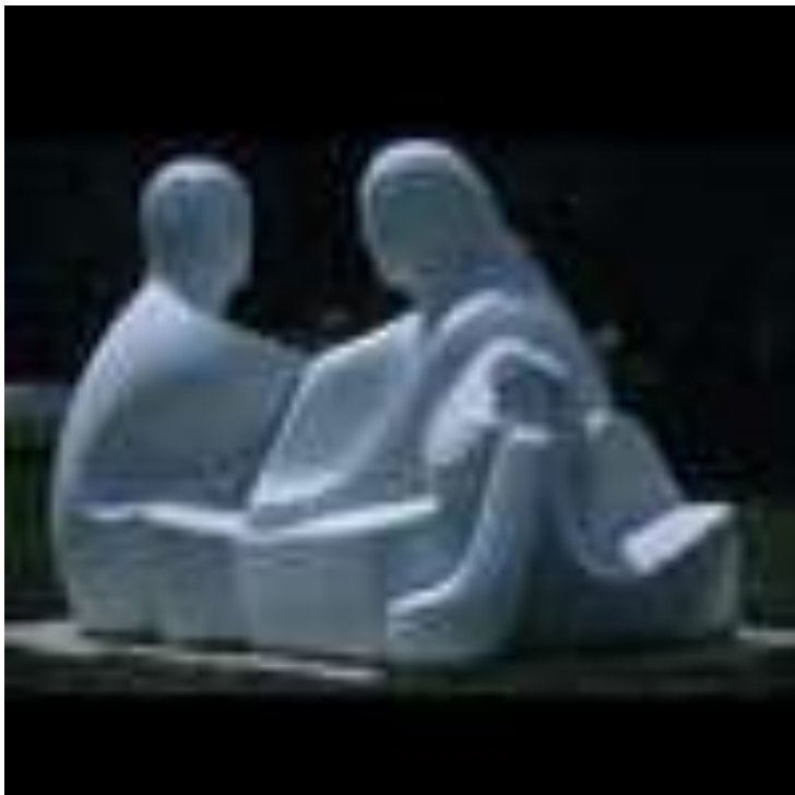
The Conversation 5' x 9' x 5' Artwork for Sale: Yes $32,000.00 2005