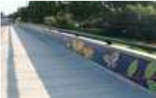
Natural Rhythm 2' x 240' x 1" Artwork for Sale: Yes $60,000.00 2021