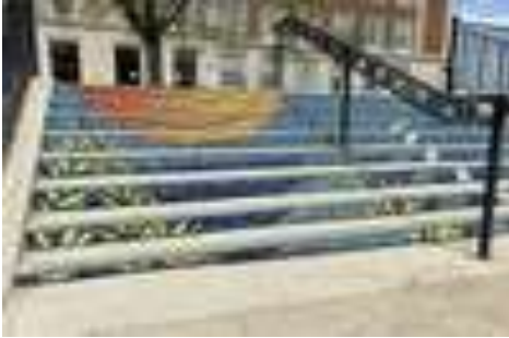
Harmony 6' x 15' x 1" Artwork for Sale: Yes $20,000.00 2022