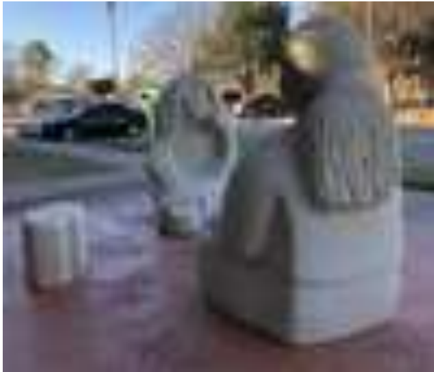
"Sharing Our Future" 5' x 4' x 3.5' Artwork for Sale: No $69,000.00 2021