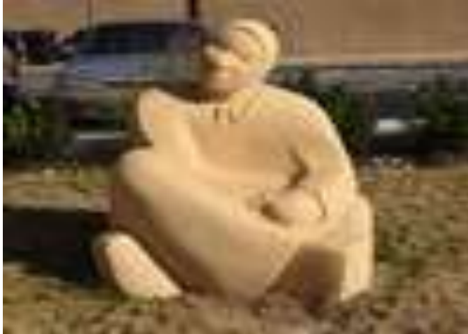
We Were Here 5' x 4' x 3' Artwork for Sale: Yes $75,000.00 2017