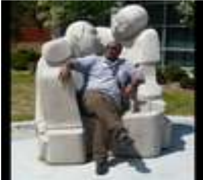
Storyteller 6' x 5' x 4' Artwork for Sale: Yes $52,000.00 2010