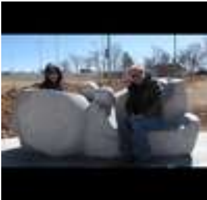
"400 Years" 3.5' x 8' x 3' Artwork for Sale: Yes $150,000.00 2012