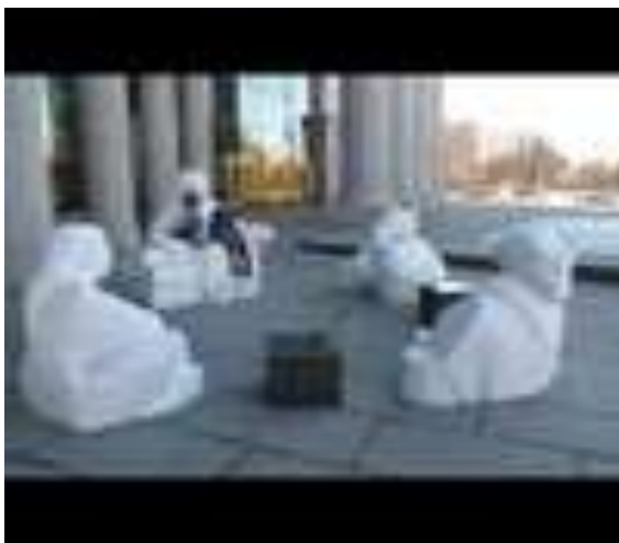
Justice for All 7' x 25' x 65' Artwork for Sale: Yes $250,000.00 2012