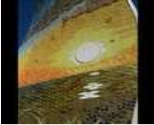
Chryshellis - detail 9' x 6' x 4' Artwork for Sale: No $50,000.00 2021