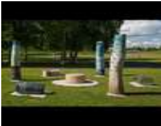
Talking Trees 8.5' x 18' x 18' Artwork for Sale: Yes