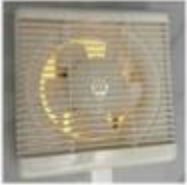
Extractor Shutter Fan