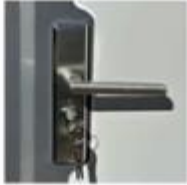
Security Door Lock