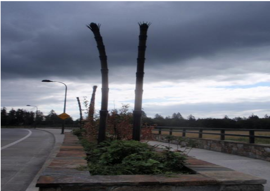
West end - bronze 'horse tails', slate planters, stone wall

Title: 'Bronze Horse Tails' Location: Boeckman Rd. Bridge Artist: Innovative Metal Design, LLC Installation: 2008