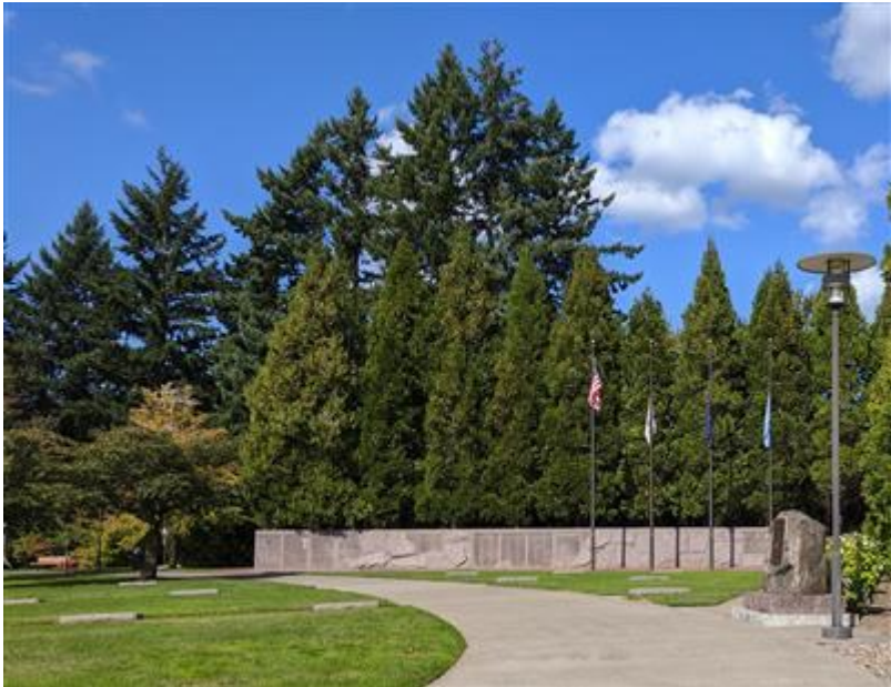
Title: 'Guardian' Location: Town Center Park Artist: Jesse Swickard Installed: January 2009