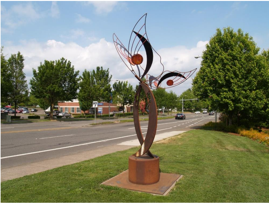
Modern Flight – Jesse Swickard Library – back