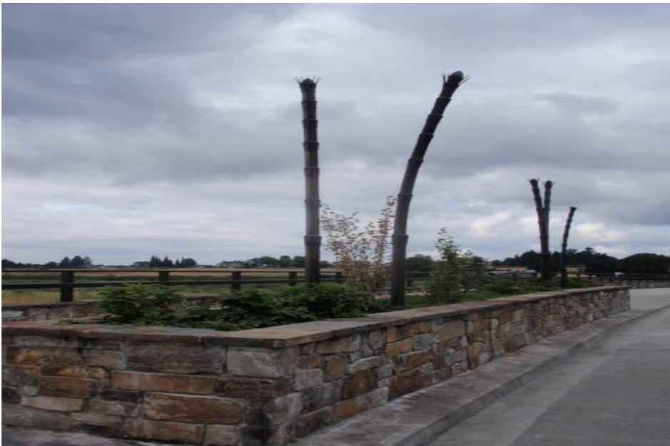
East end – bronze 'horse tails', slate planters, stone wall