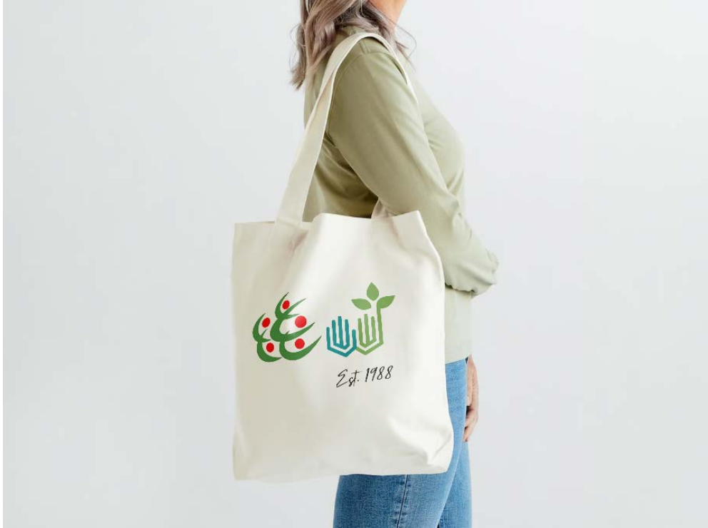
Tote Bag | Qty. 50 = $862.50