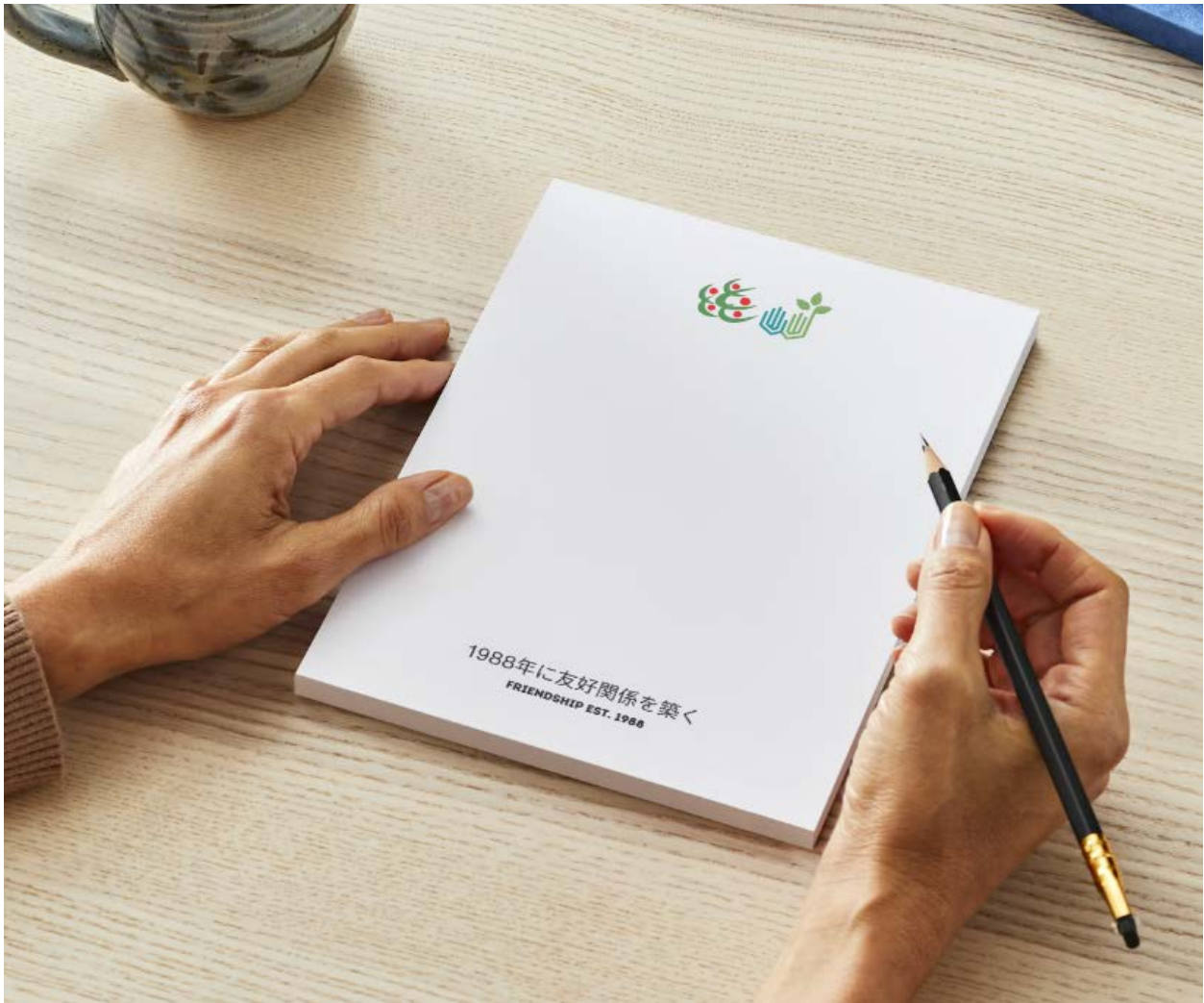
Notepads (100 sheets each, 6 x 7.75 in) | Qty. 100 = $1,150