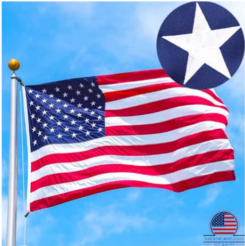
Roll over image to zoom in