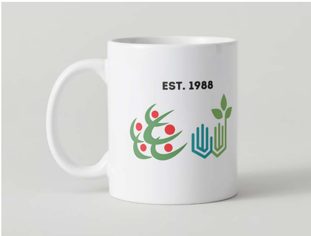
Mugs | Qty. 36 = $378