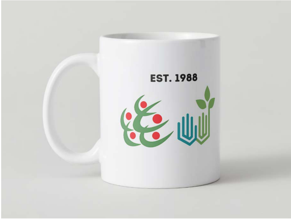
Mugs | Qty. 36 = $378