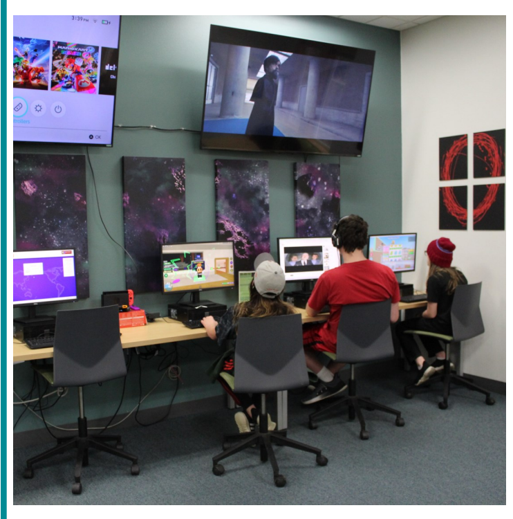
Teens play videogames and watch movies during a Teen After-School Drop-in Event.

• "May the Fourth Be With You and Your Goats" Star Wars Day on Saturday, May 4, 3-5pm