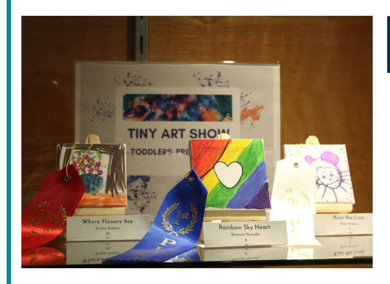
Winners of the Toddler-Preschool category in the Tiny Art Show on display in the library lobby throughout April.