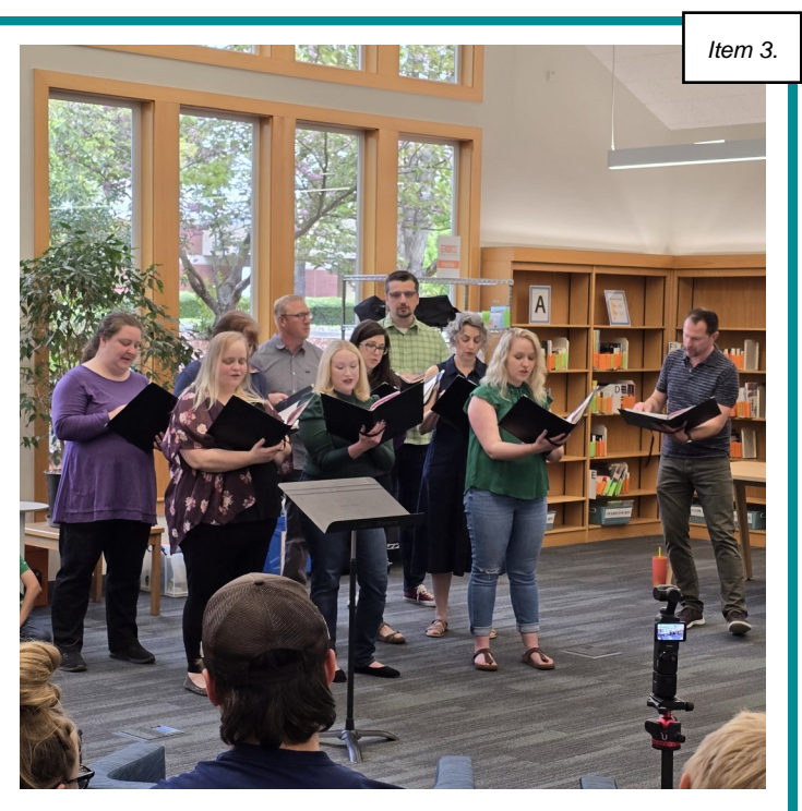
Wilsonville Choral Arts Society performs at the library on Saturday, April 20.

• Space Talk about "Voyager 1's Pale Blue Dot" on Saturday, May 4, at 11am.