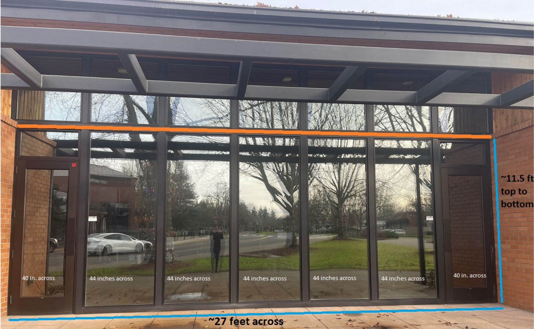
Image of Site. Mural will be on area UNDER the orange line. Windows are found at the Parks & Recreation Admin. Building 29600 Park Pl. Painting on exterior outside glass ONLY (no painting on black framing). Approx 310 Sq Ft. Measurements are not exact.