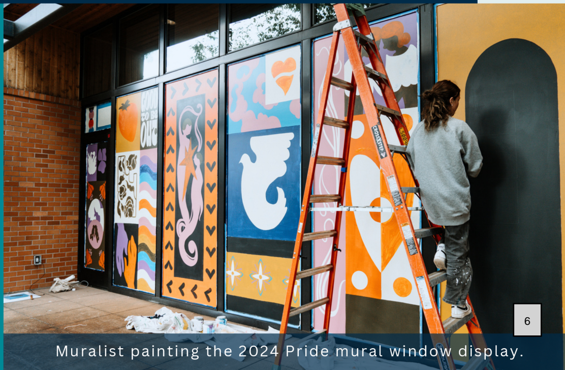
Muralist painting the 2024 Pride mural window display.

Town Center Park Saturday, June 7, 2-4pm