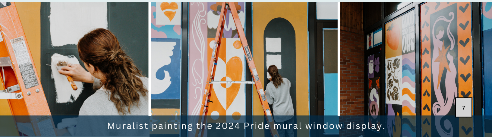
Muralist painting the 2024 Pride mural window display.