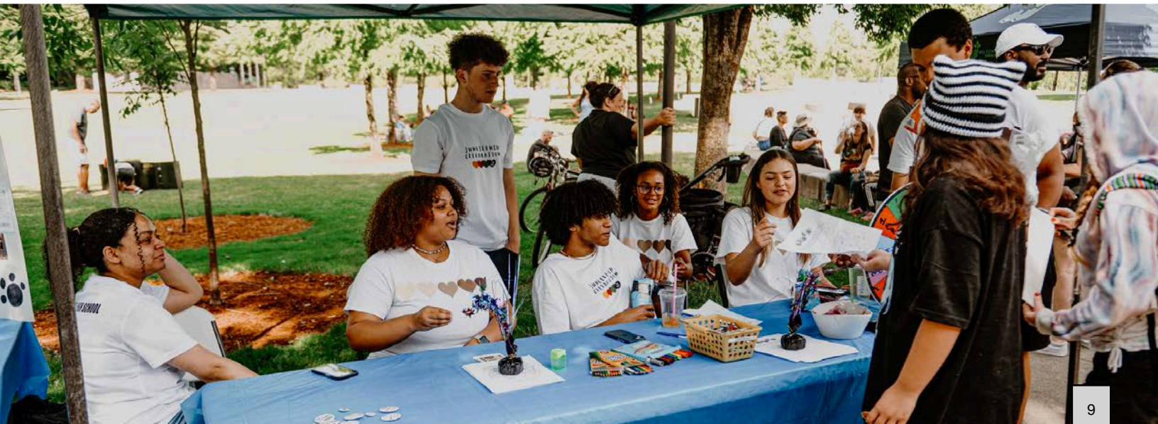
Wilsonville High’s Black Student Union at the 2024 Juneteenth Event.

We are hoping to build on this momentum, and to continue to offer free music, food and educational materials. To make this possible, we are seeking generous support from the Wilsonville community.