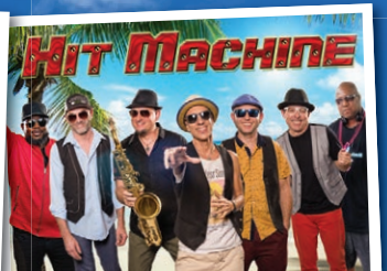
AUGUST 10 / Hit Machine Hits/Dance/Pop Music

5:30 pm Thursdays • Town Center Park • www.WilsonvilleConcerts.com • FREE