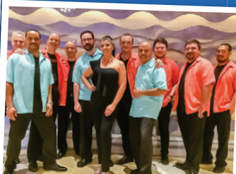
AUGUST 4 / Conjunto Alegre Latin/Salsa Music