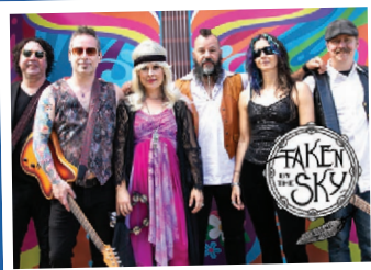
JULY 20 / Taken by the Sky Fleetwood Mac Tribute