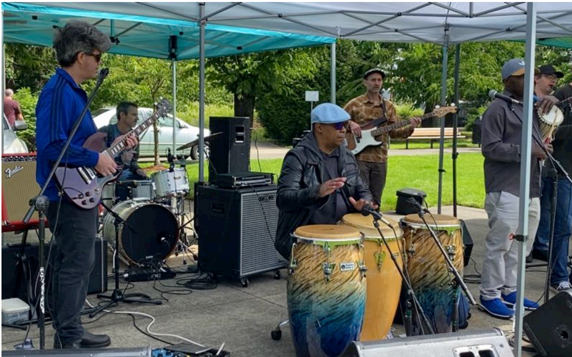
A 10-piece Juju band, Jujuba, performs at the 2022 Juneteenth event.