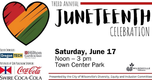
2023 Facebook post