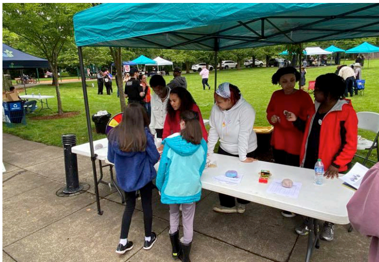
Wilsonville High’s Black Student Union at the 2022 Juneteenth Event.

We are hoping to build on this momentum, and to continue to offer free music, food and educational materials. To make this possible, we are seeking generous support from the Wilsonville community.