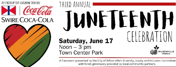
2023 event banner