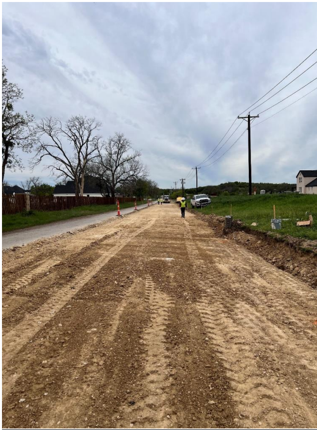
King's Gate Road looking south