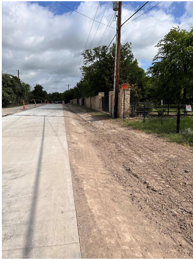
Crown Road looking north