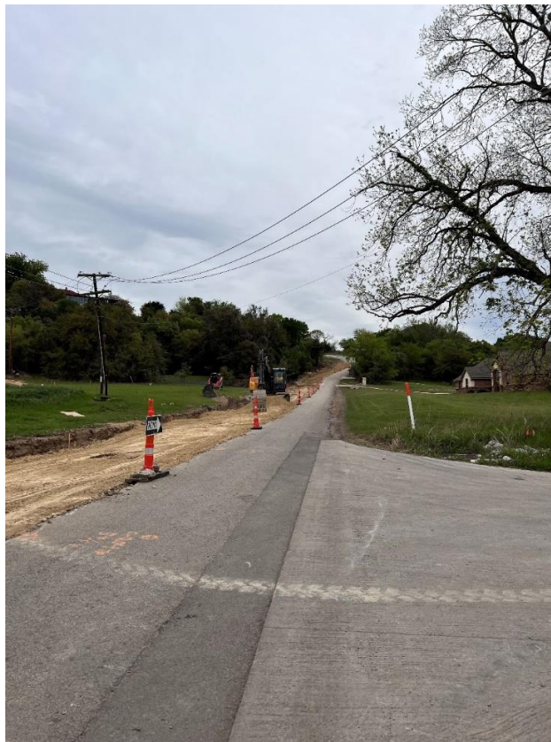
King's Gate Road looking north