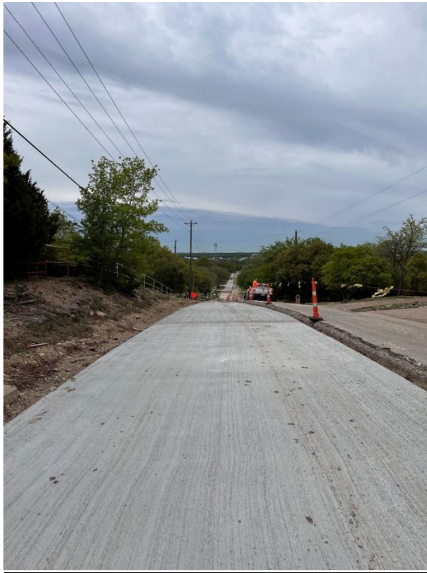
Crown Road looking south