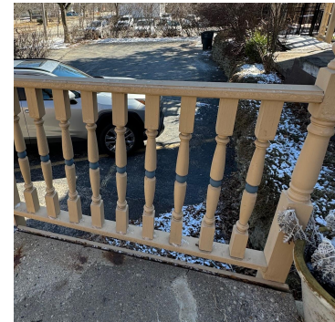
Example of turned spindles