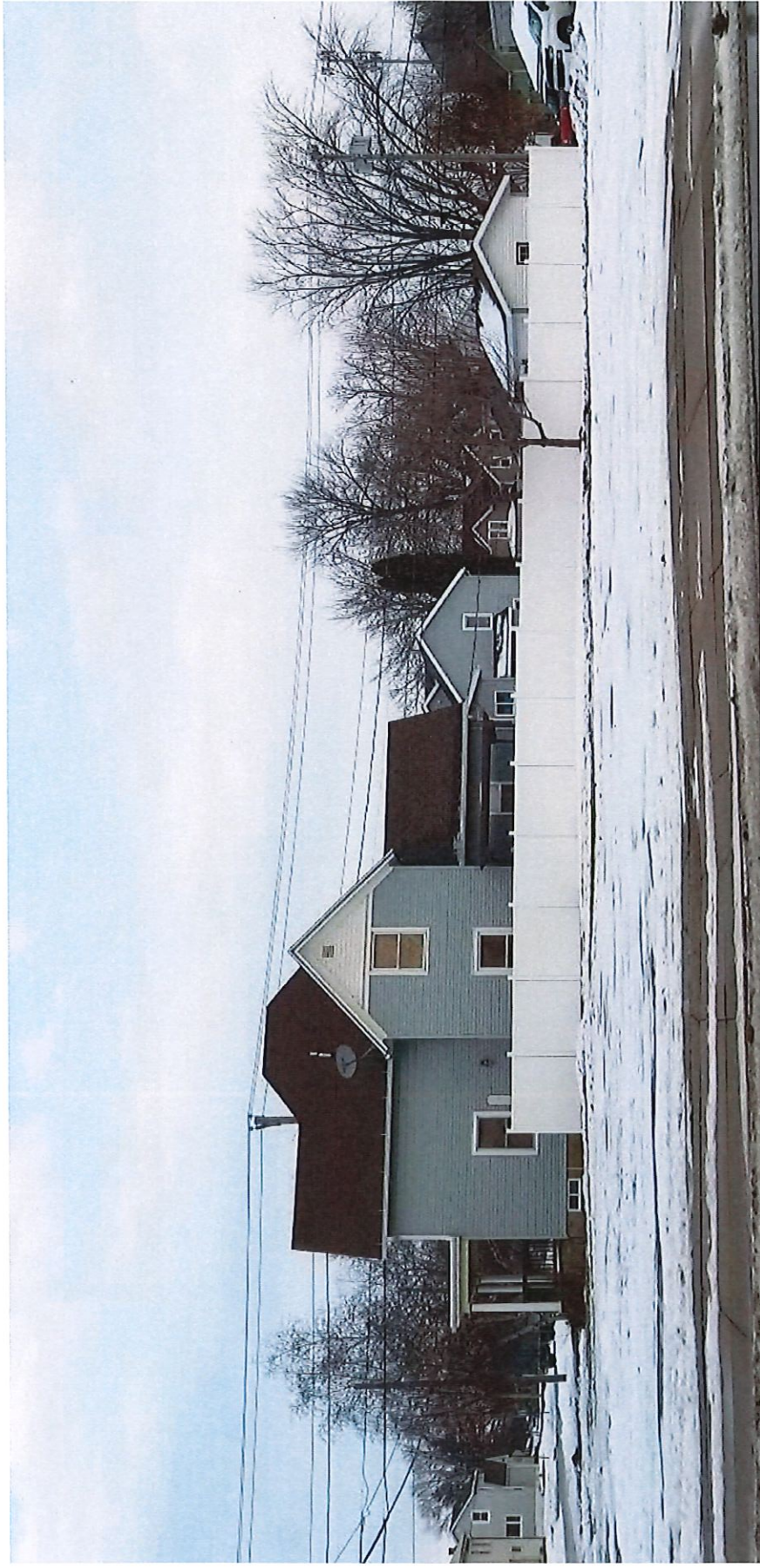
Property at 26 W Main Street (Former McDowell Gas Station) Condition Use Required Fence Installation (complete)