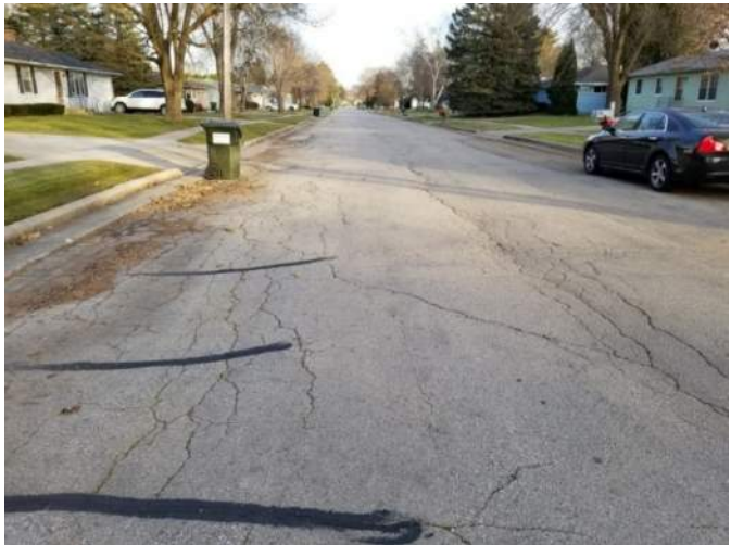
Before Construction – At Mid-Block of Rock Ave. (Looking East)