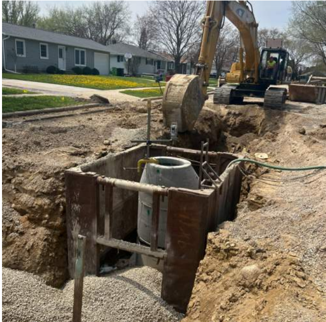
During Construction – Typical Installation of a New Sanitary Manhole