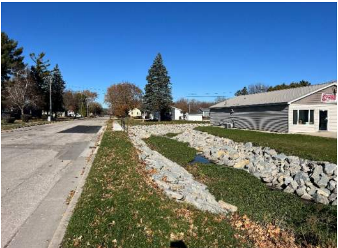
After Construction – Harris Creek near Stobb Plumbing (Looking North)