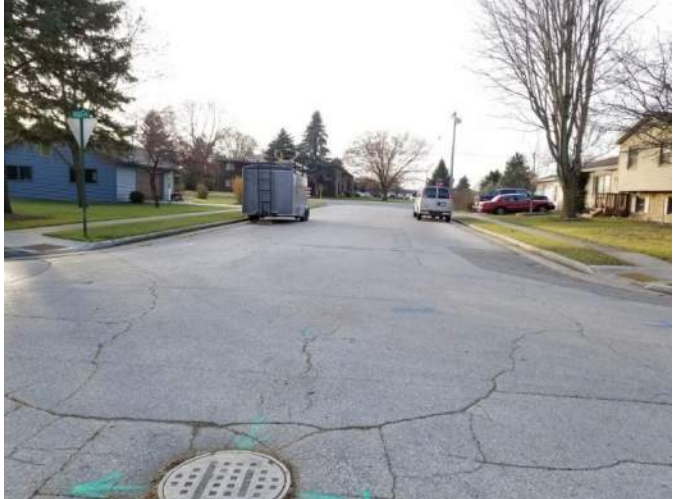
Before Construction – Newton, Rock, & Rock River Intersection (Looking West)