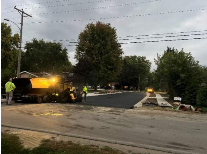
During Construction – Typical Installation of New Asphalt Binder Course