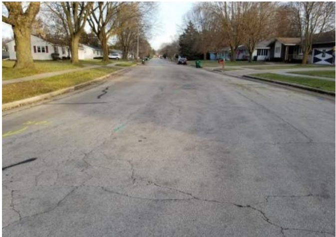
Before Construction – At Curve Along Rock Ave. (Looking East)