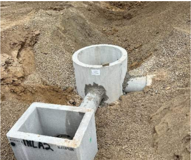
During Construction – Typical Installation of New Storm Sewer Manhole