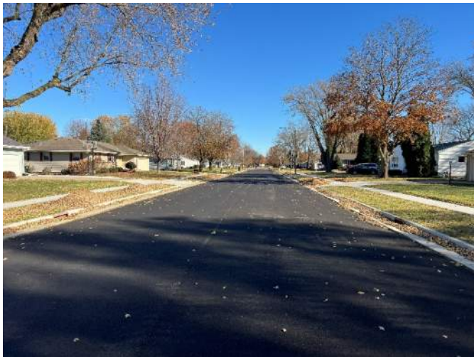
After Construction – At Curve Along Newton Ave. (Looking East)