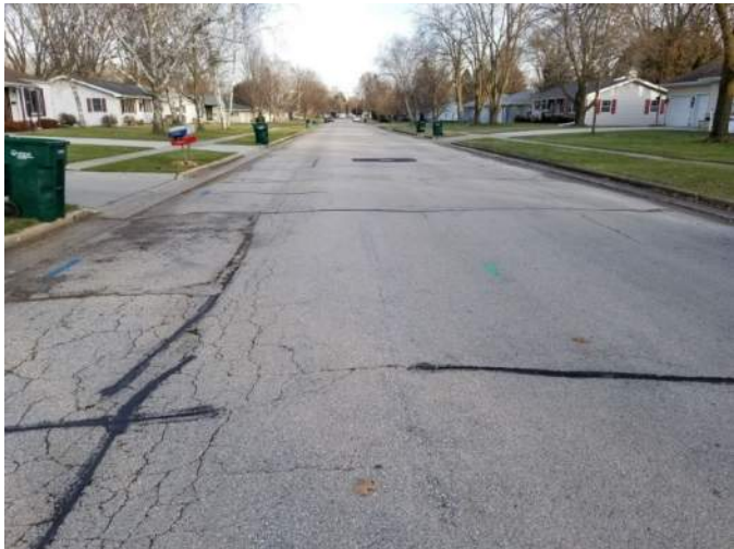
Before Construction – At Mid-Block of Newton Ave. (Looking East)