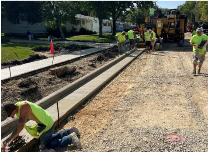
During Construction – Typical Installation of New Concrete Curb & Gutter