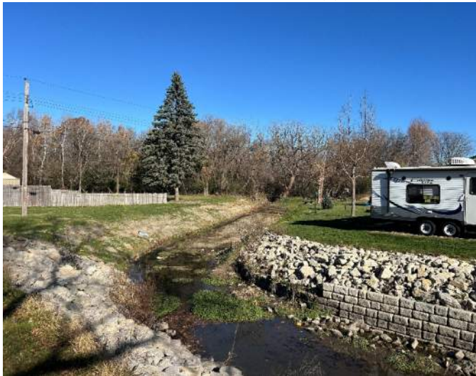
After Construction – Harris Creek north of Newton Ave. (Looking Northeast)