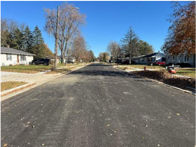
After Construction – At Mid-Block of Rock Ave. (Looking East)