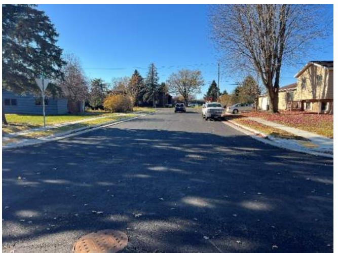
After Construction – Newton, Rock, & Rock River Intersection (Looking West)