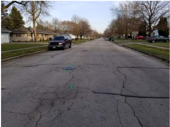
Before Construction – At Curve Along Newton Ave. (Looking East)