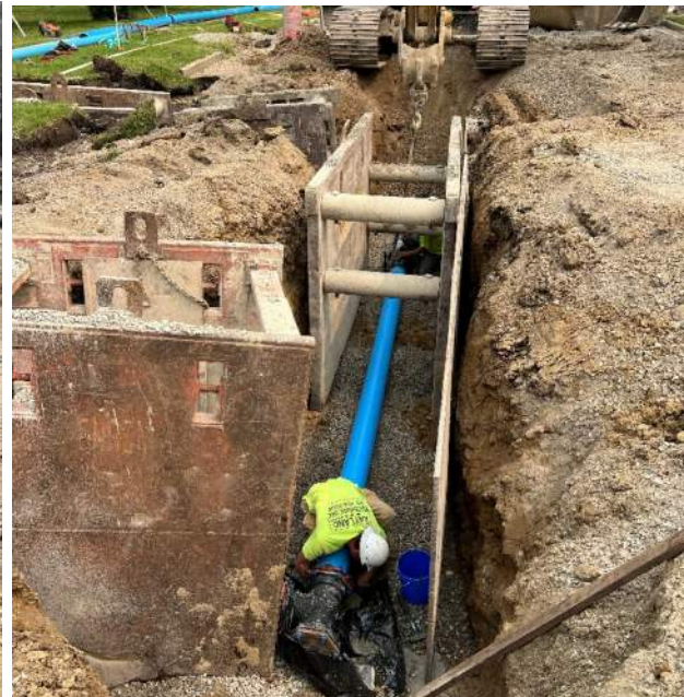
During Construction – Typical Installation of New Water Utilities