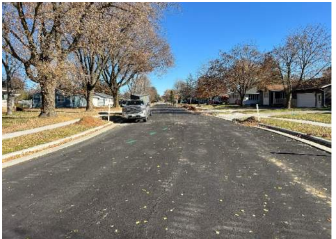
After Construction – At Curve Along Rock Ave. (Looking East)