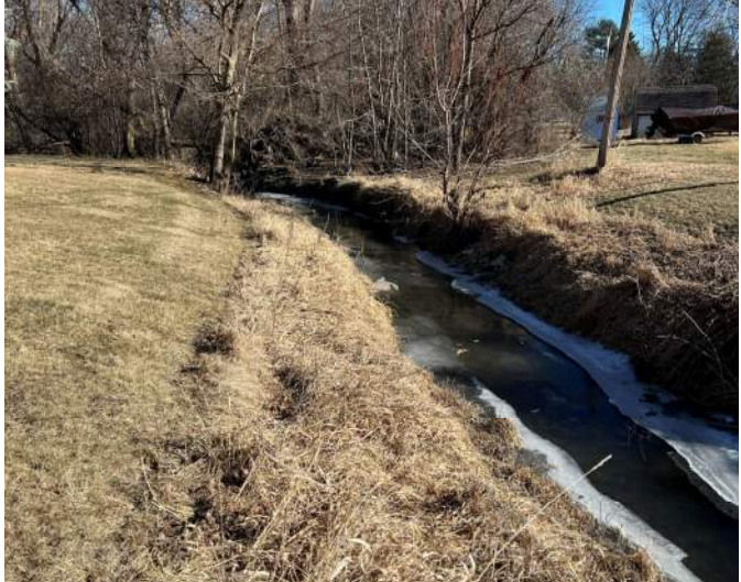
Before Construction – Harris Creek north of Newton Ave. (Looking Northeast)