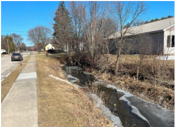
Before Construction – Harris Creek near Stobb Plumbing (Looking North)