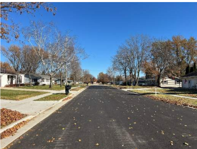
After Construction – At Mid-Block of Newton Ave. (Looking East)