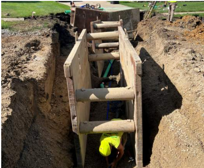
During Construction – Typical Installation of Sanitary & Water Laterals