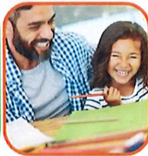
Library Summer Reading Program