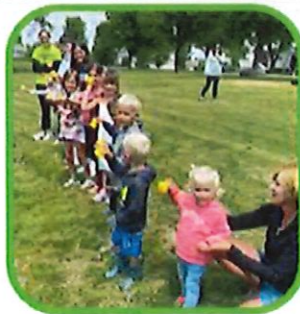
Waupun Park Program