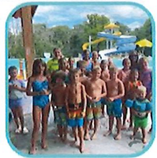
Waupun Family Aquatic Center

Contact Information: Call: (920) 324-7930 Email: parks@cityofwaupun.org Facebook: Waupun Recreation Department