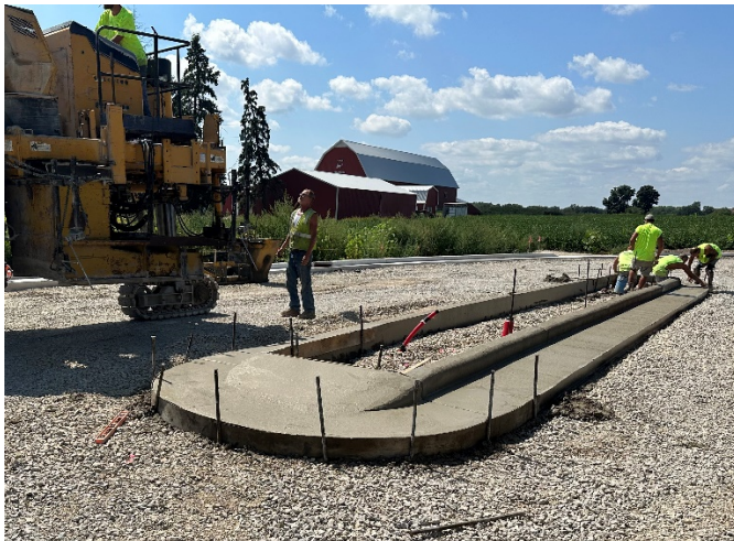
During Construction – Typical Installation of New Concrete Curb & Gutter