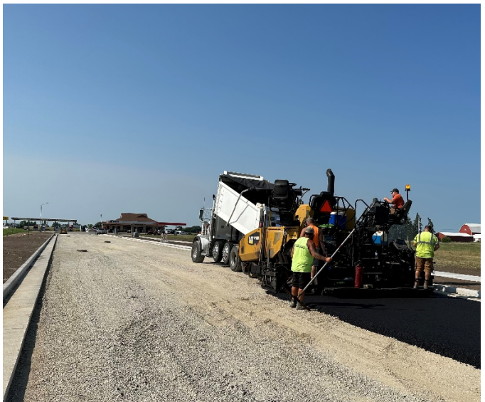
During Construction – Typical Installation of New Asphalt Binder Course