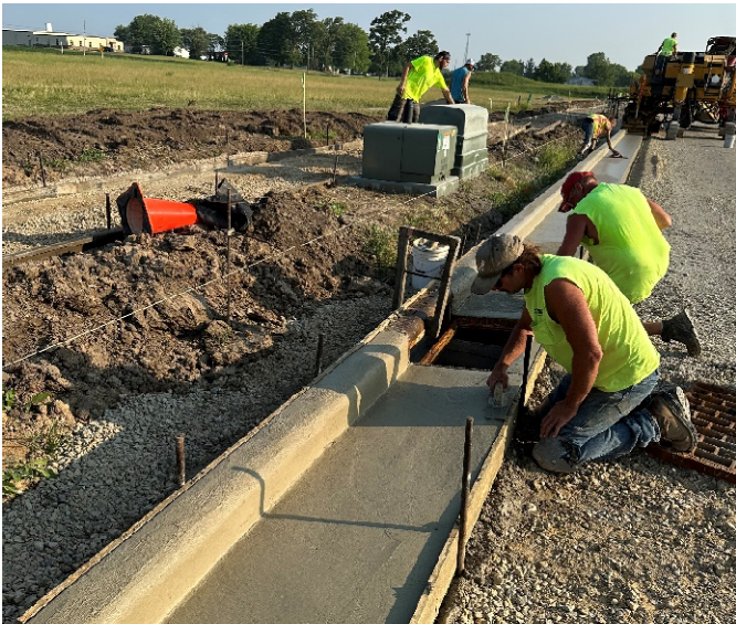
During Construction – Typical Installation of New Concrete Curb & Gutter