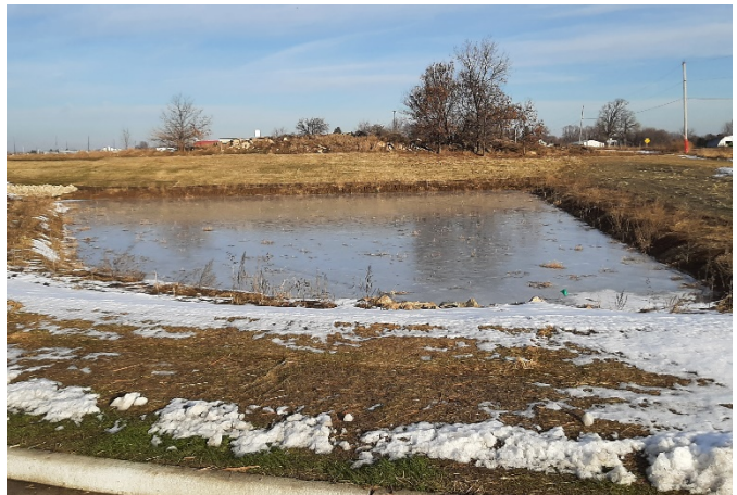
After Construction – New Regional Storm Water Pond