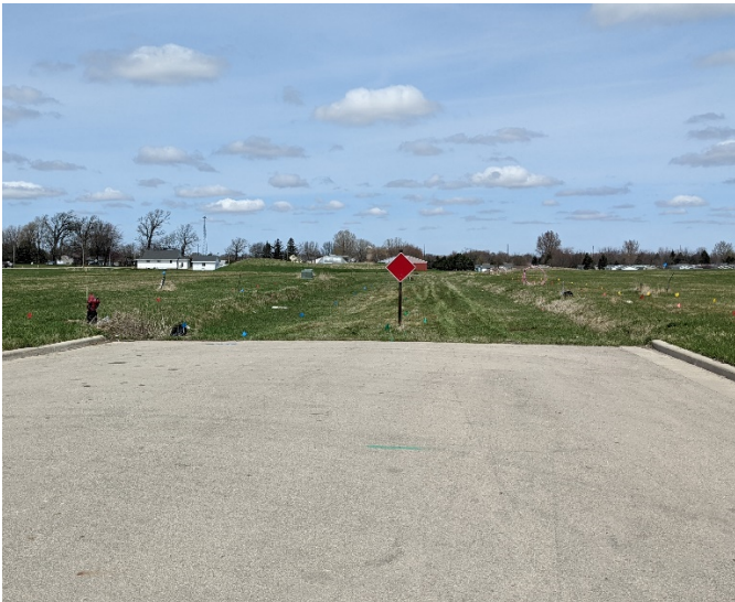
Before Construction – At Shaler Dr. & Bayberry Ln. intersection (Looking North)