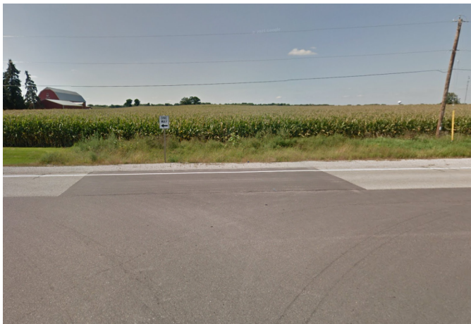
Before Construction – At S.T.H. 26 and Shaler Dr. intersection (Looking West)