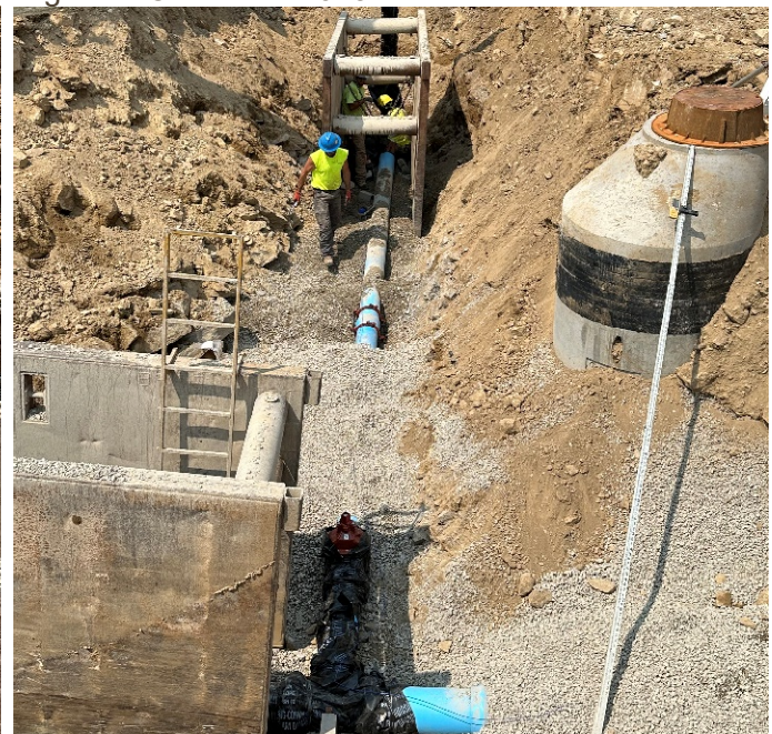
During Construction – Typical Installation of New Water Utilities