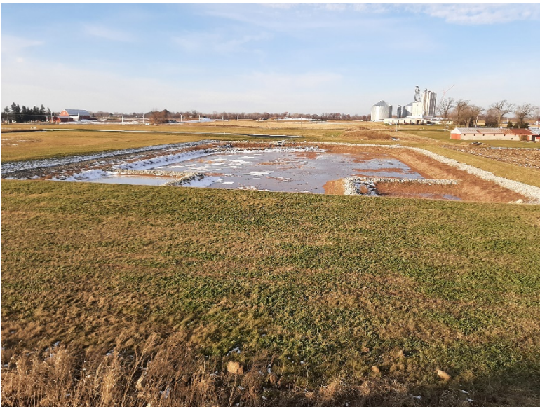
After Construction – New Storm Water Pond (N.E. end of Bayberry Ln.)

The project began construction in September of 2022 with the installation of the storm water management pond on the northeastern end of Bayberry Lane. Underground storm sewer utility installation work began in April of 2023. The installation of the new street gravel base, curb & gutter, asphalt pavement, as well as the restoration of the project site were completed during May to July of 2023.