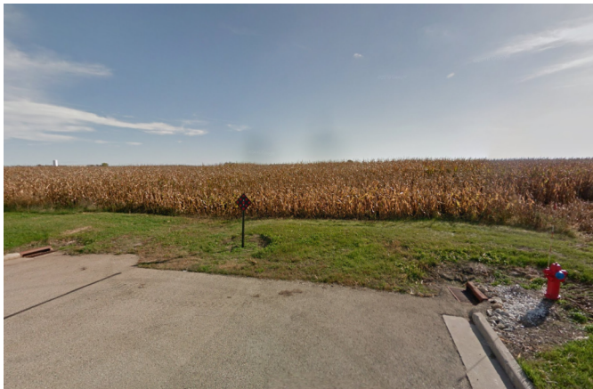
Before Construction – At north end of project along Wilson Dr. (Looking South)