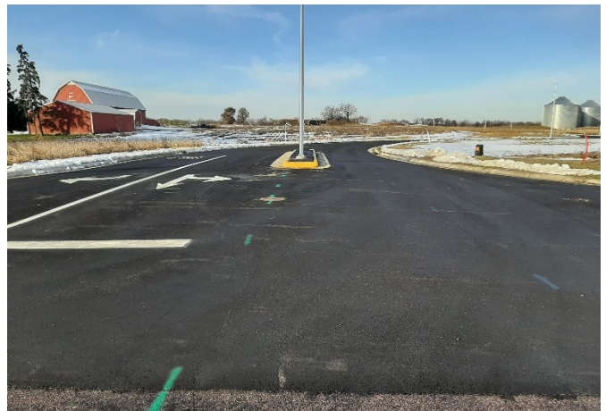
After Construction – At S.T.H. 26 and Shaler Dr. intersection (Looking West)