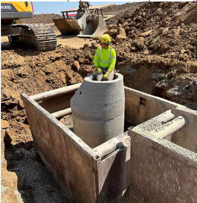
During Construction – Typical Installation of a New Sanitary Manhole

The project began construction in May of 2023 with rock blasting work. Between May and July 2023, the installation of the proposed underground public utilities (sanitary, water, and storm), the storm water management pond, and the site grading occurred. Afterwards, the installation of the new street as well as the restoration of the project site were completed during August to October of 2023.