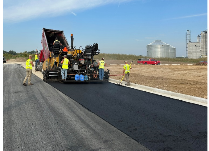
During Construction – Typical Installation of New Asphalt Binder Course