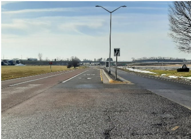
After Construction – New Left Turn Lane at S.T.H. 26 and Shaler Dr. intersection (Looking South)