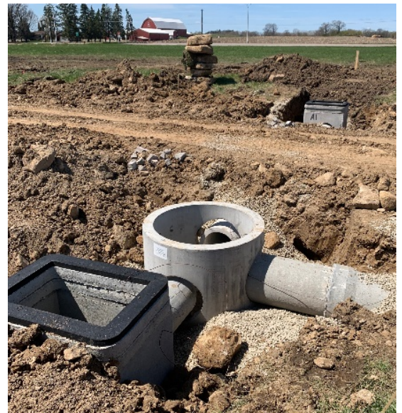
During Construction – Typical Installation of New Storm Sewer Manhole