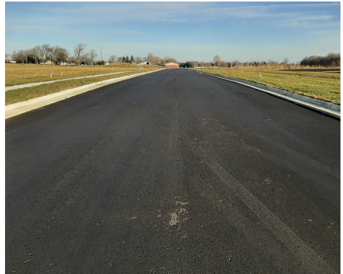
After Construction – At Shaler Dr. & Bayberry Ln. intersection (Looking North)