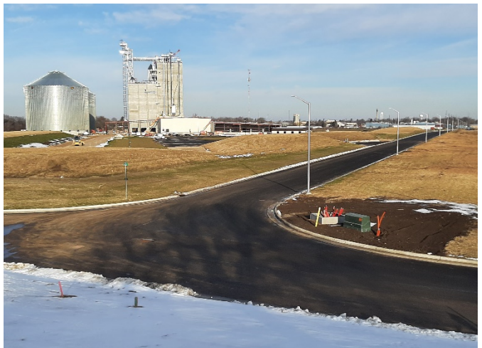
After Construction – At Shaler Dr. & Wilson Dr. intersection (Looking North)