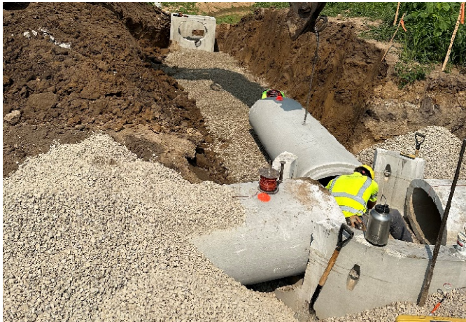
During Construction – Typical Installation of New Storm Sewer Manhole