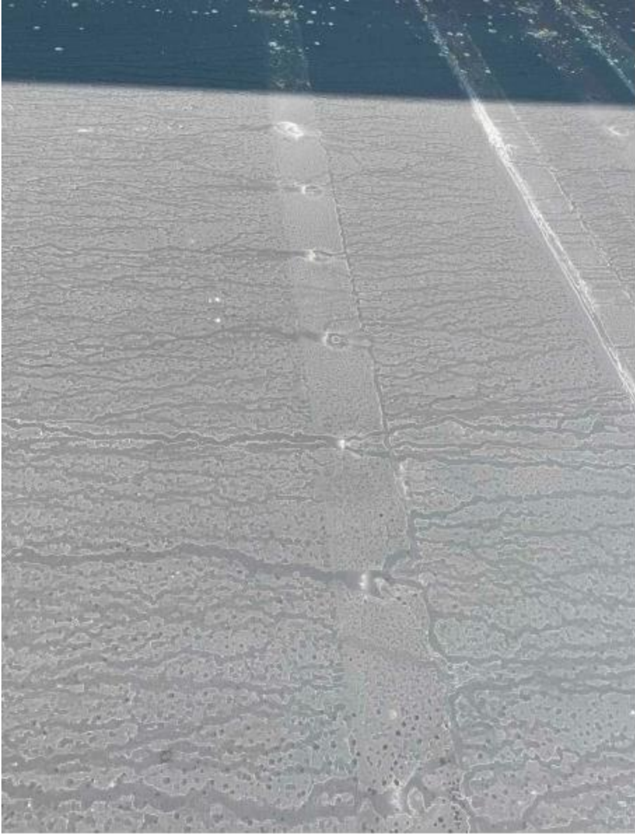
Rubber Roof No damage