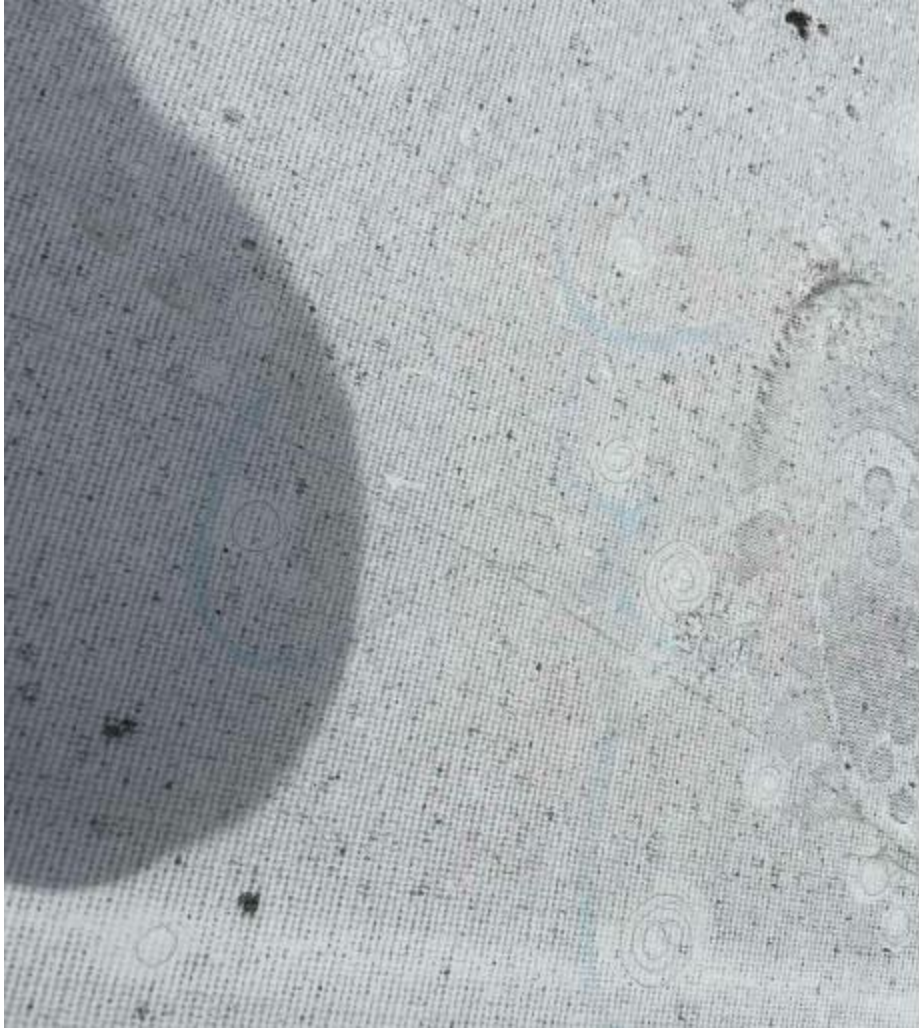
Additional photo of spiral fractures