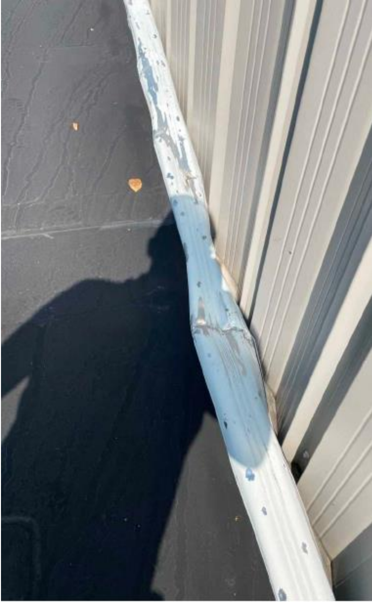
Manmade and old damage to downspout