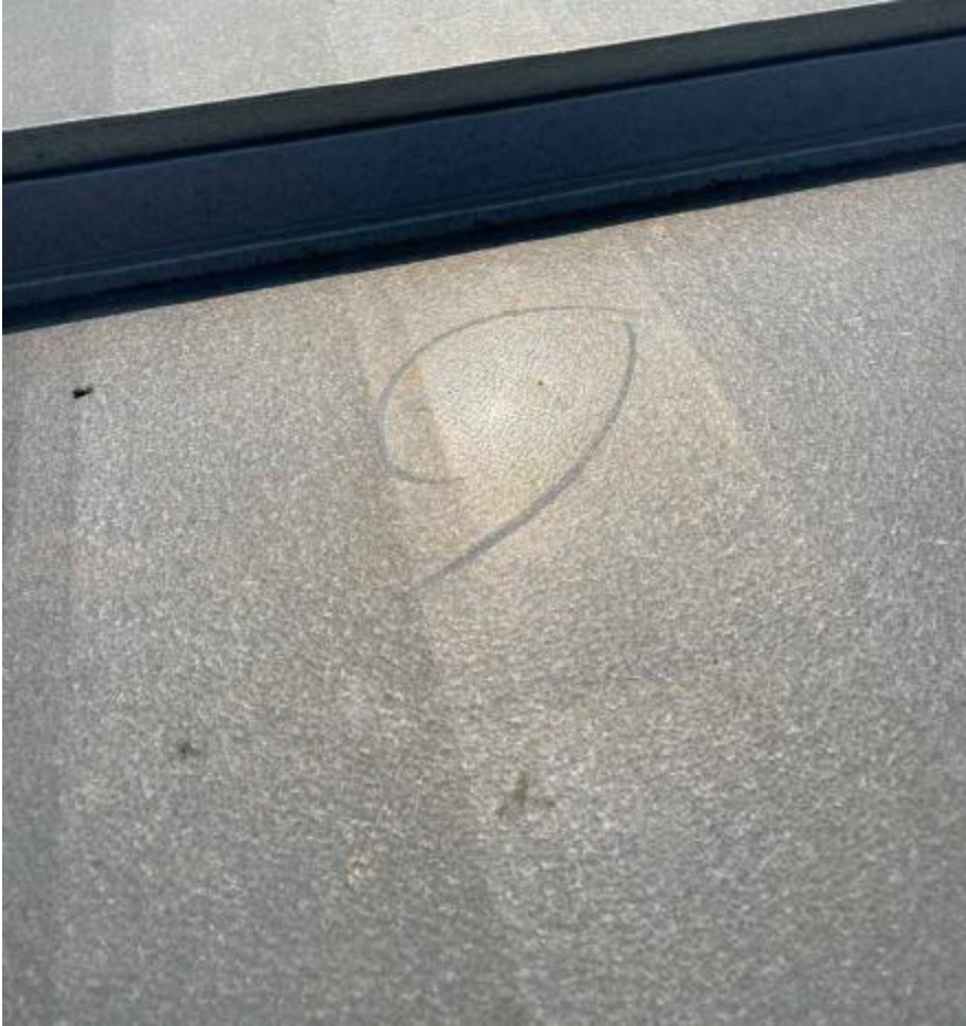
Possible hail hit to metal roof. Dirt /debris on roof. No damage