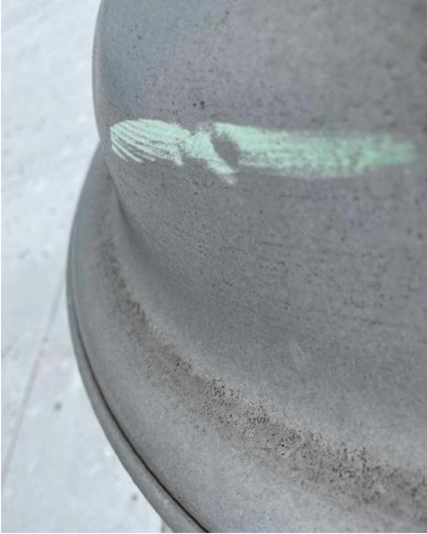
Possible hail damage to vent stack