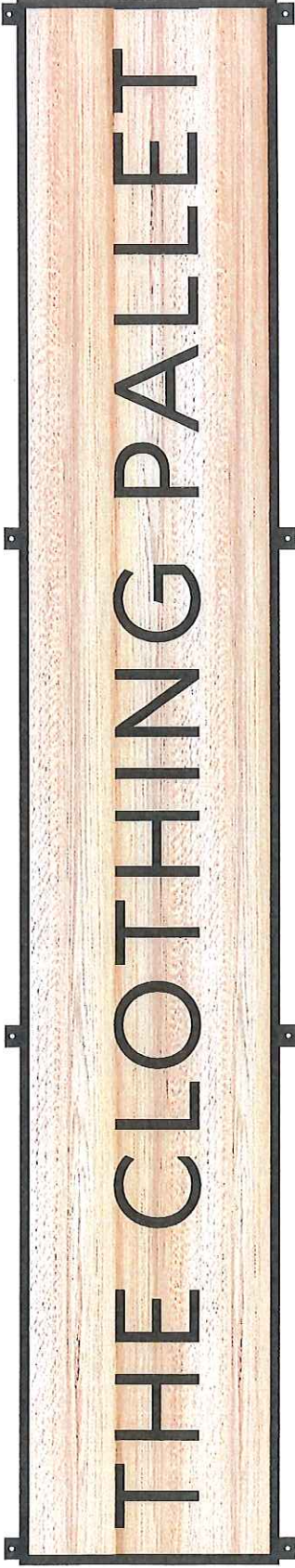
Front of sign