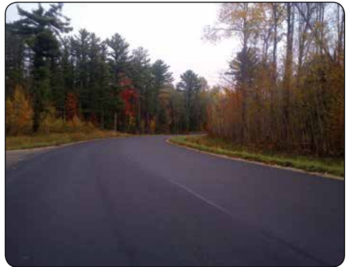
◆ Step Four: Let surface dry, broom excess sand, open project to traffic.