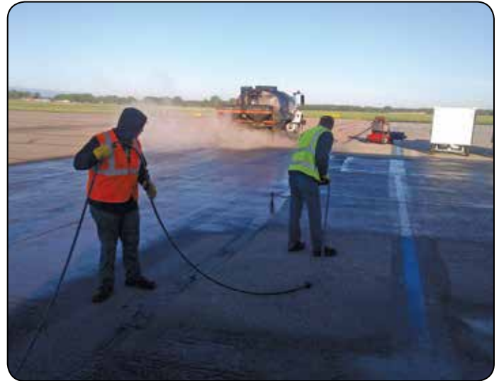
◆ Step Two: Hand spray around concrete curbs, lights, etc.