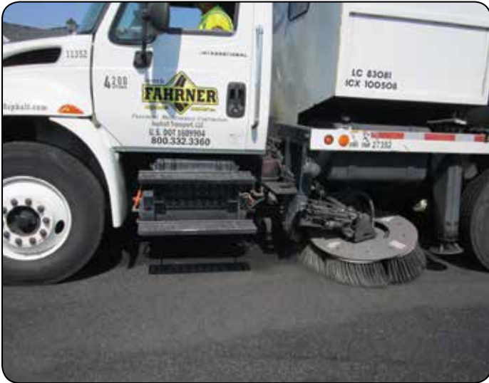
◆ Step One: Clean asphalt surface so it is free of all debris.