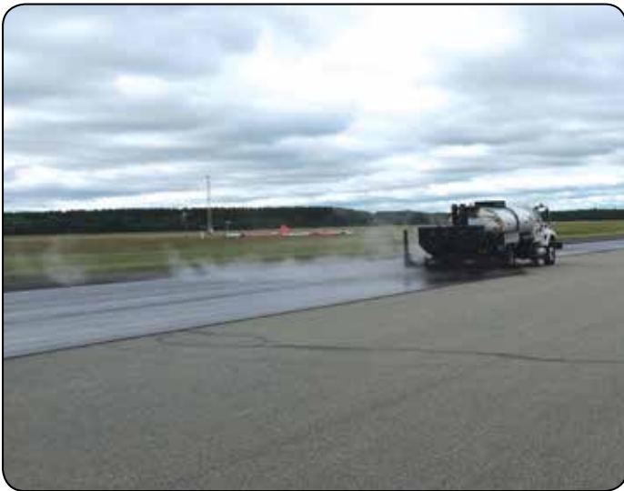
◆ Step Three: Apply GSB and sand to mainline areas.