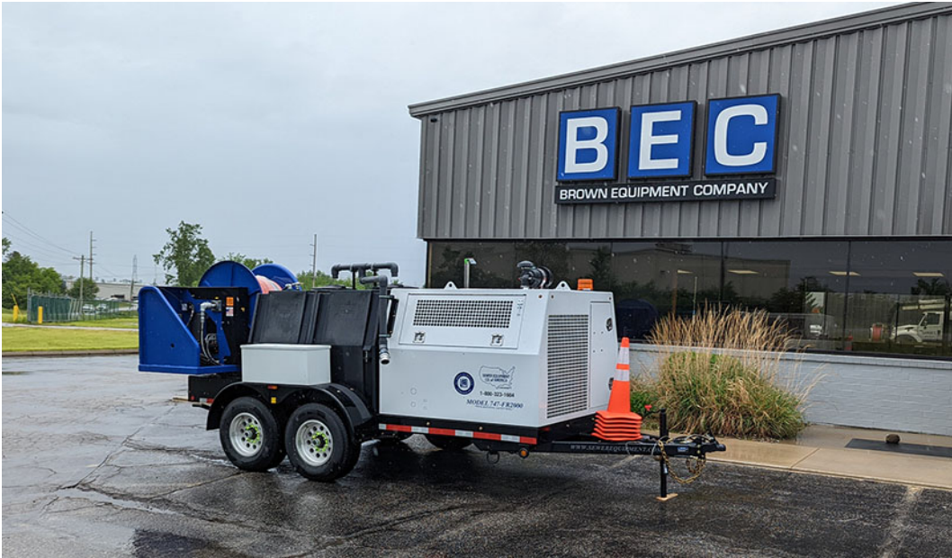
Photo for reference only. Quoted unit may differ. THANK YOU FOR CHOOSING BROWN EQUIPMENT COMPANY