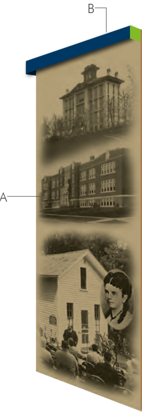
Example of light bar return