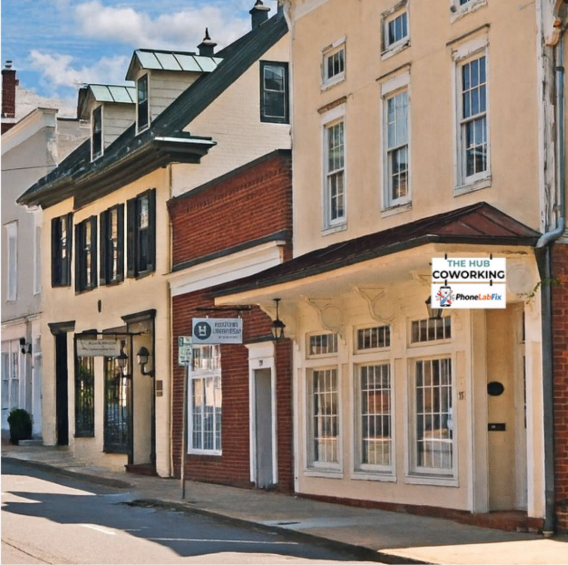
Proposed sign placement Scale approximate