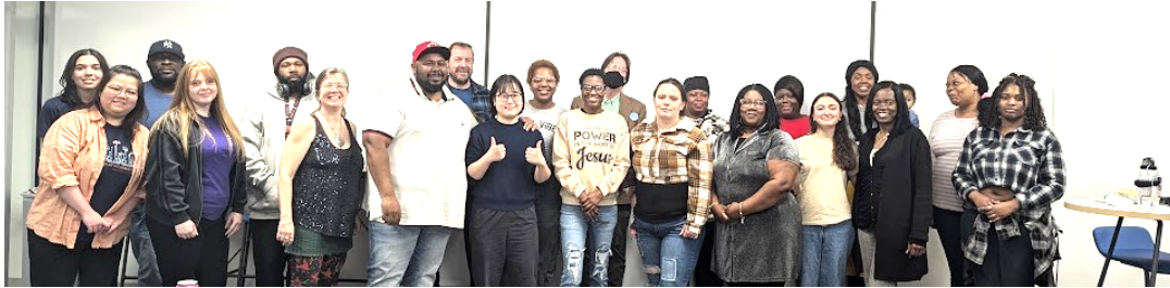
(A photo from April's graduation event, with members from the *CDC*, CTSO staff, digital navigator trainers and graduates, and their friends and family)