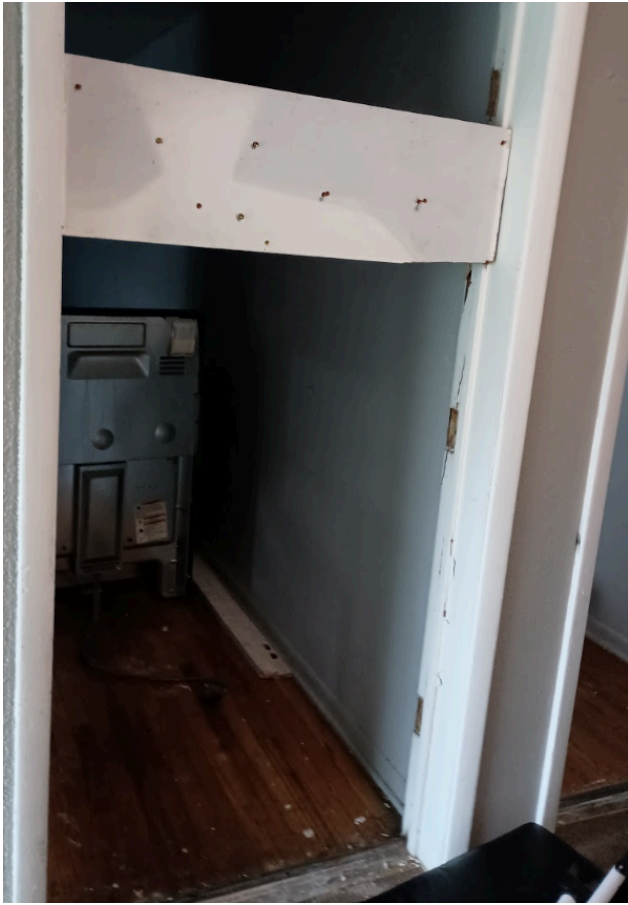
Garbage, unsanitary conditions