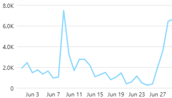
Instagram reach ⓘ