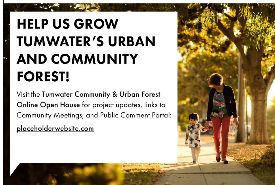
Figure 1. Postcard Mailed by City