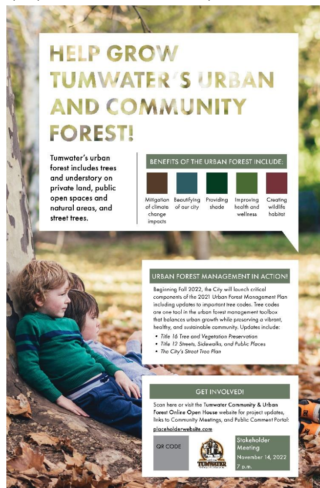
Figure 2. Project Poster