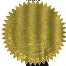
Addison B. Hinrichs Secretary of the Senate