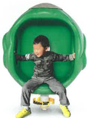
Cozy Pod Spinner UPLAY-033 | $5,372.85