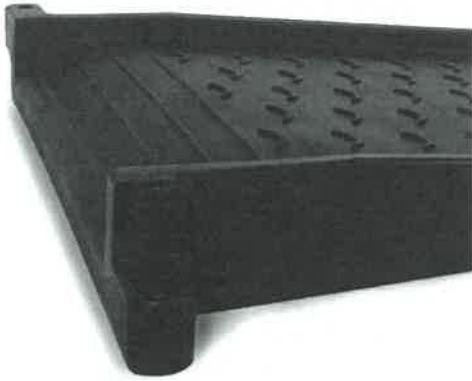
Accessible Ramp Timber 02-07-0078 | $601.97

Package Includes: Installation with safety surfacing and borders timbers if necessary. Freestanding packages must be purchased with Playground Packages as add-ons.