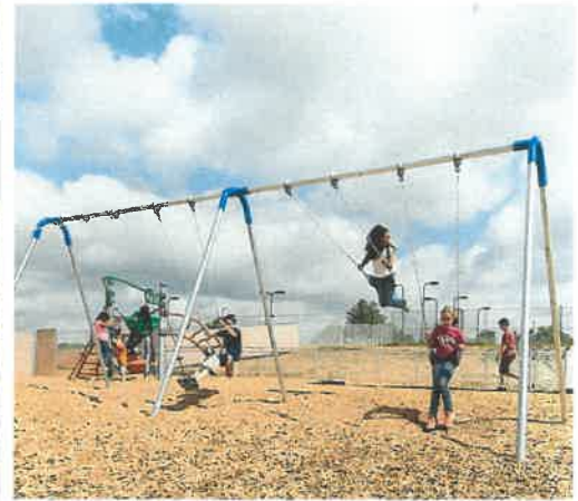
Double Bay Swing Set PBP-8-2SC | $8,979.03