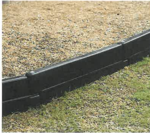
4' x 12" x 3" Border Timber 02-07-0038 | $54.05