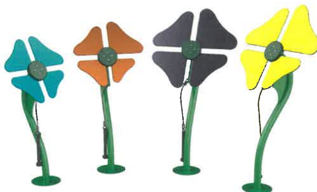
Flower Package COL-FWR | $6,068.95