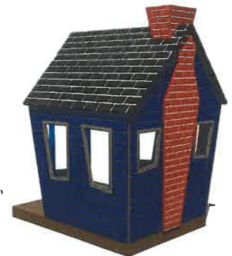
Countryside Cottage UPLAY-038 | $6,835.07