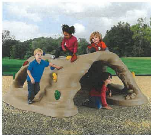
Climb and Discover Cave UP120 | $7,693.85