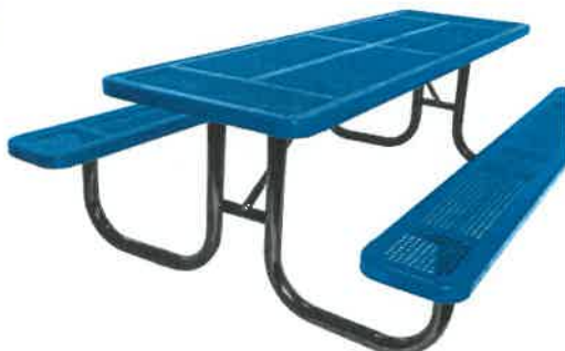
Standard Picnic Table 238-P6 | $1,481.03