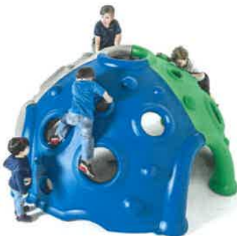
Moon Crater Climber UPLAY-032 | $7,152.89