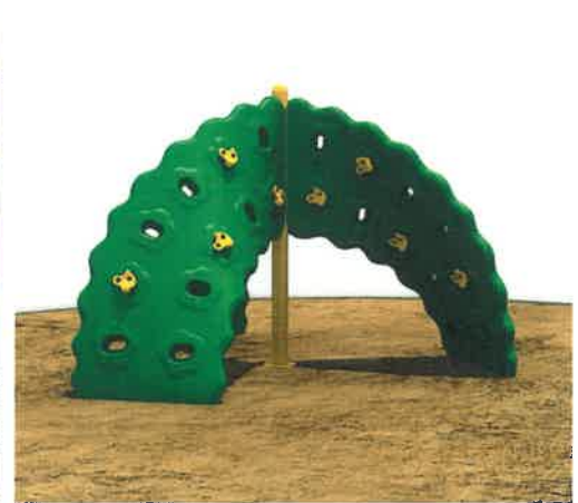
Mountain Twist UP158 | $5,942.90