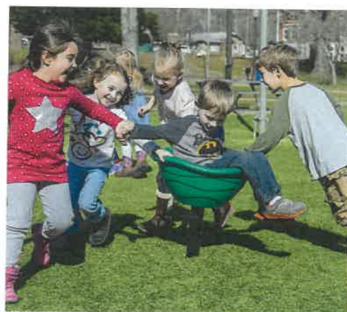
Whirl and Twirl Spinner UP100 | $2,653.94