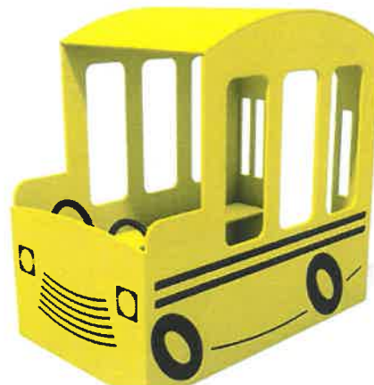
School Bus M59027 | $5,895.73