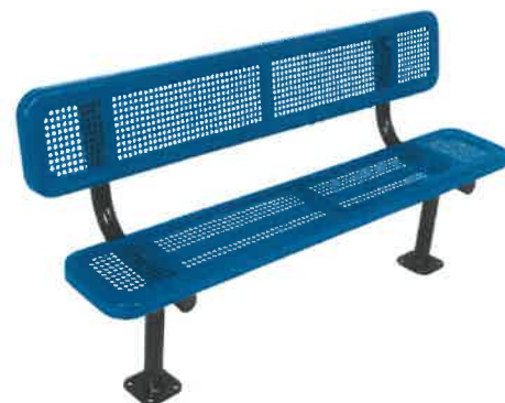
6' Standard Bench 940S-P6 | $848.22