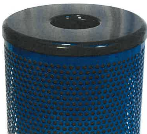
32 Gallon Receptacle PR-32 | $451.60