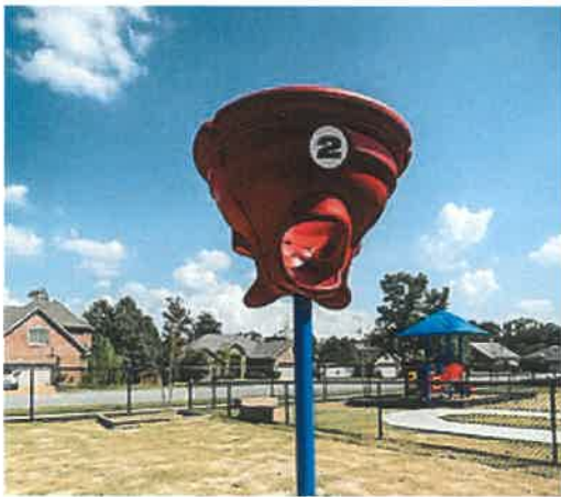
UltraToss UP114 | $1,097.71