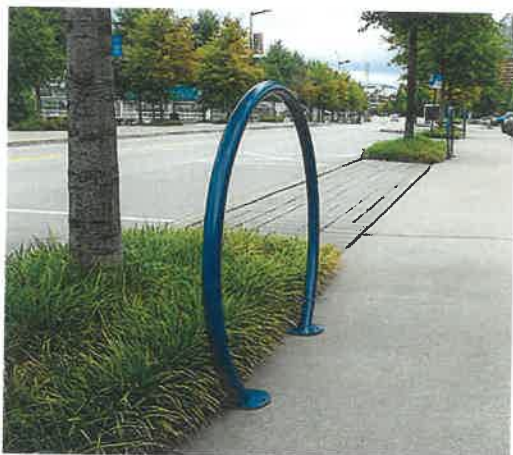
Solstice Bike Rack 5000S | $296.08

Package Includes: Installation with safety surfacing and borders timbers if necessary. Freestanding packages must be purchased with Playground Packages as add-ons.