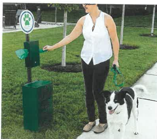
Dog Waste Station PBARK-490 | $456.82