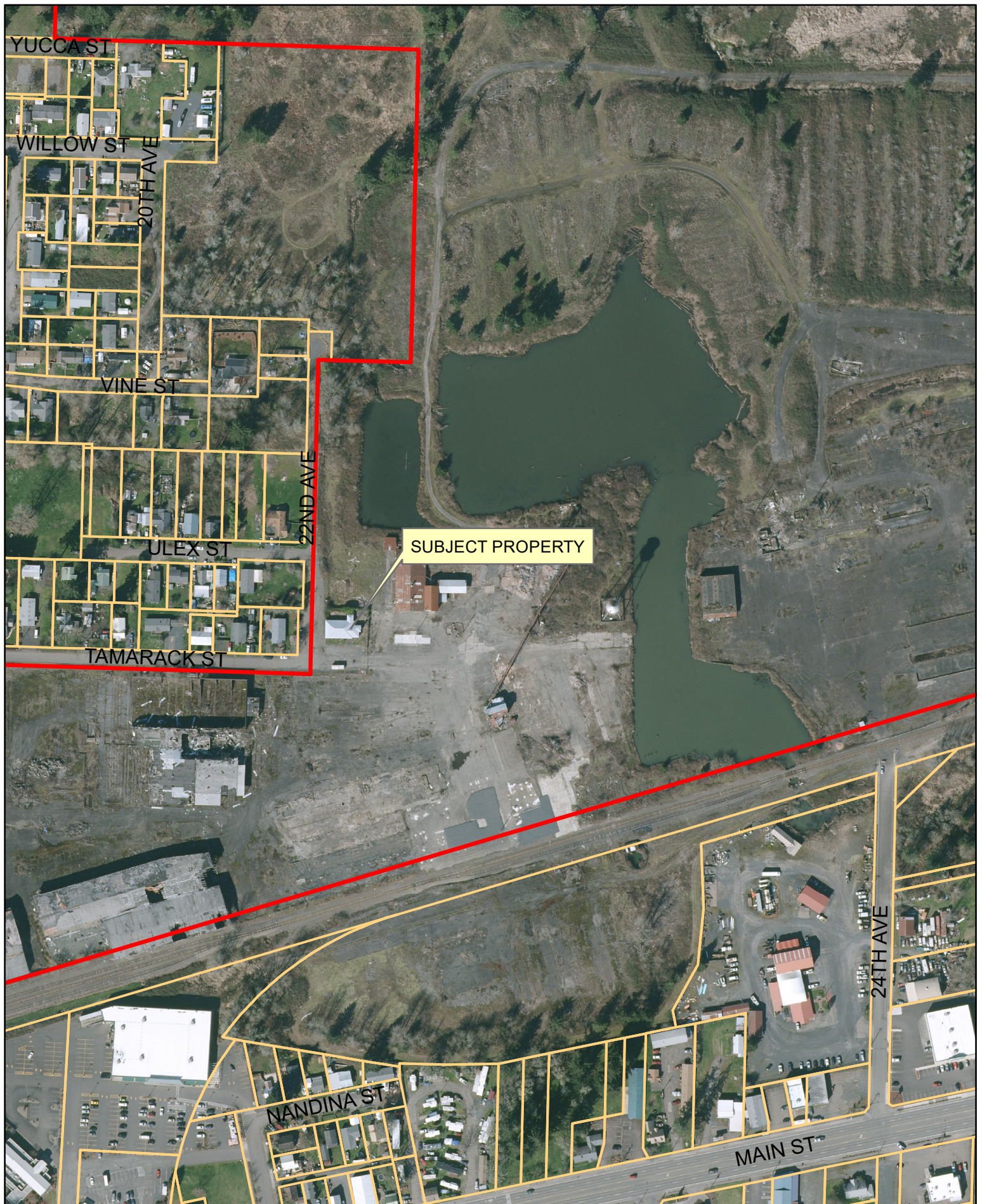
Subject Property Map CU22-13