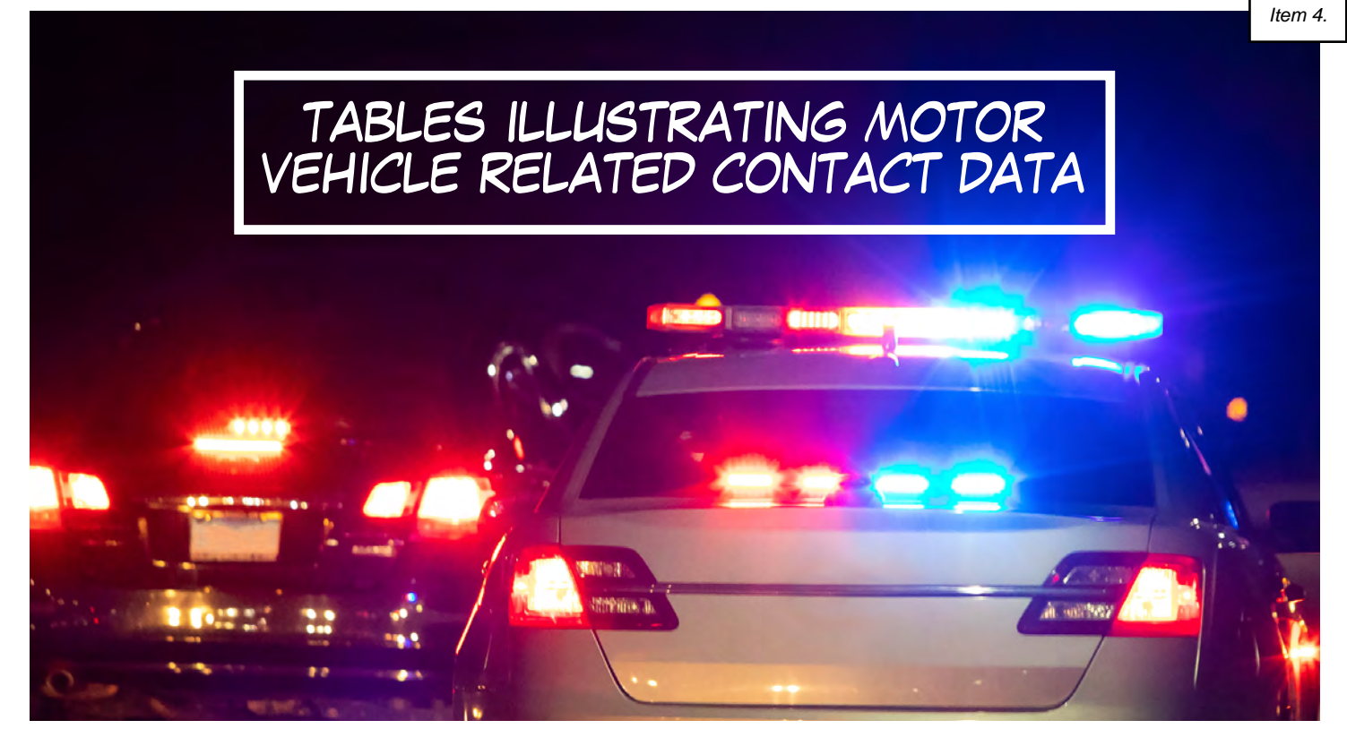
Table 1. Citations and Warnings