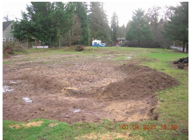
Subject property looking south to Fir Street.