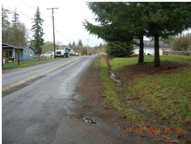
Looking north along Firlok Park Street. Subject property on right.

The subject property is a rectangular shaped lot at 20,473 square feet or 0.47 acres. It is located at the corner of Firlok Park Street (Firlock Boulevard) and Fir Street. It is currently vacant, but the applicant has received approval for a septic system for a detached single-family dwelling through the County. Firlok Park Street is a developed collector classified street without frontage improvements (sidewalks, curb, and landscape strip) on either side. Fir Street is a local street without any frontage improvements. Both roads are within the County's jurisdiction. The parcel is generally flat sloping towards the two streets with a few sparse trees around the perimeter. There is a stormwater ditch along Firlok Park Street and along the shared northern property line.