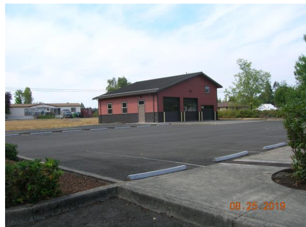
Subject property's parking lot and garage/storage building