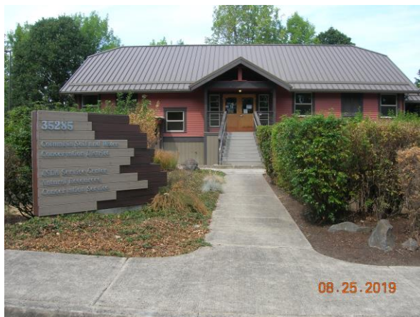
Subject property from Millard Road

The subject property is 1.05 acres and was the former location of the Warren Grange and Calvary Chapel Fellowship Church. In 2011, the County approved a Determination of Similar Use permit (DSU 11-01) to convert the building into space for Columbia Soil & Water Conservation District (CSWCD) facilities. The approval allowed the "non-conforming Warren Grange, Community Service Institutional Use" to be modified for CSWCD use. CSWCD also leases a portion of the building to the National Resource Conservation Service (NRCS), a wing of the US Department of Agriculture (USDA). Between 2012 and 2013, a two-story garage was built on the property adjacent to the parking lot for NRCS vehicles and general storage. The subject property abuts South Division to the east and Millard Road to the south. Both roads are deficient in their right-of-way widths and lack frontage improvements, although a portion of Millard Road is improved with sidewalks abutting the property. The property is accessed from Millard Road into a fully developed, paved parking lot.