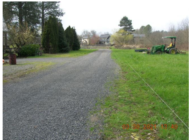
Six Dees Lane looking west towards the remainder of the property