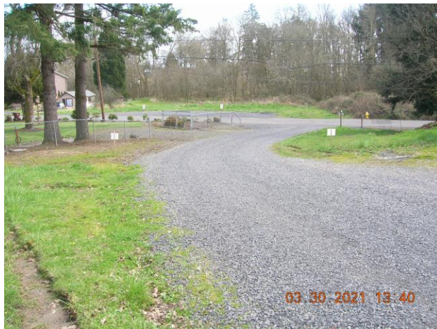
Six Dees Lane looking south towards Columbia Blvd.

A Building Permit (No. 749-15076) was approved to construct a new detached single-family dwelling on the portion of the lot which is already within City limits. As part of the development of the detached single-family dwelling (and connection to City utilities), the applicant is required to annex the remainder of the property into City limits.