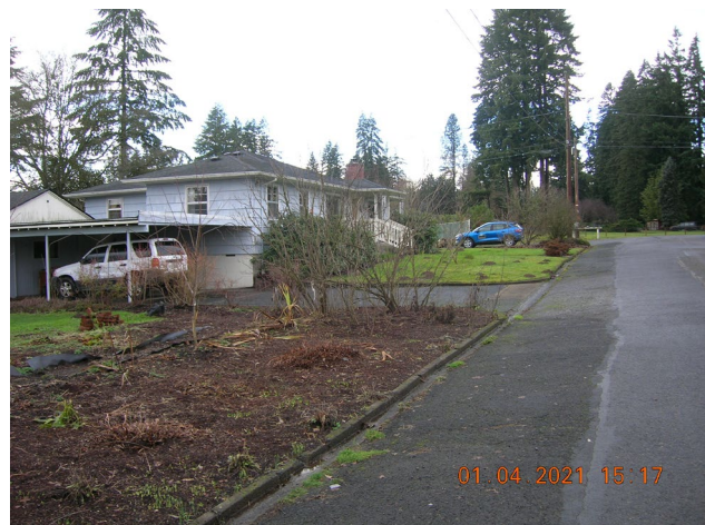
Subject property on left. Driveway approach shown with curb and gutter along Firway Lane.