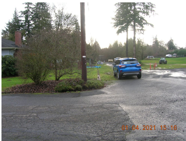
Subject property on left. Undeveloped Kavanaugh Street right-of-way pictured on right.

The subject property is developed with a detached single-family dwelling on a square-shaped, corner lot at 22,500 square feet or 0.52 acres. It is made of two lots from the Golf Club Addition Subdivision. It is accessed by Firway Lane with a paved driveway to a covered carport (pictured on right below). Firway Lane is a developed local classified street without sidewalks on either side, but it does have a curb and gutter along the abutting property. The subject property also abuts Kavanaugh Street right-of-way to the west, which is a gravel undeveloped right-of-way also lacking frontage improvements (although it does have a curb abutting the subject property). Both streets are within the County's jurisdiction. The dwelling is connected to McNulty water and not connected to City sewer, although City sewer is available in Firway Lane and Kavanaugh Street.