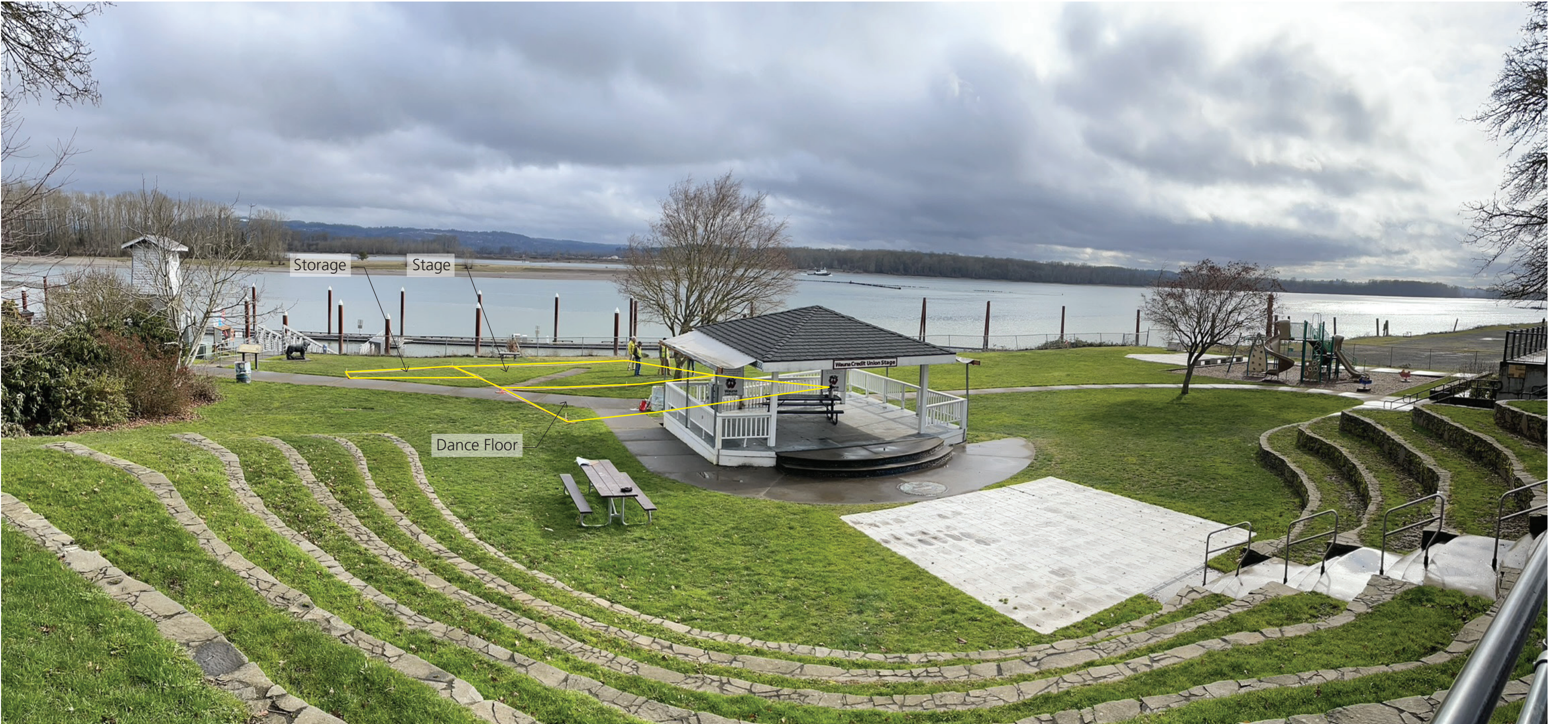
View looking southeast from top of amphitheater