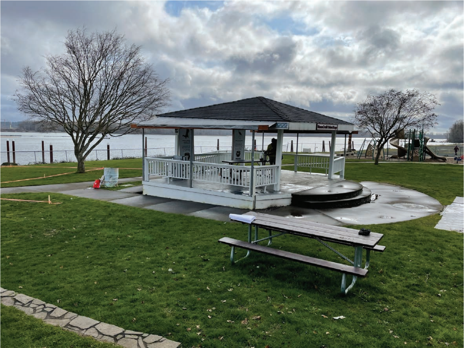
View looking southeast toward existing stage from amphitheater seats