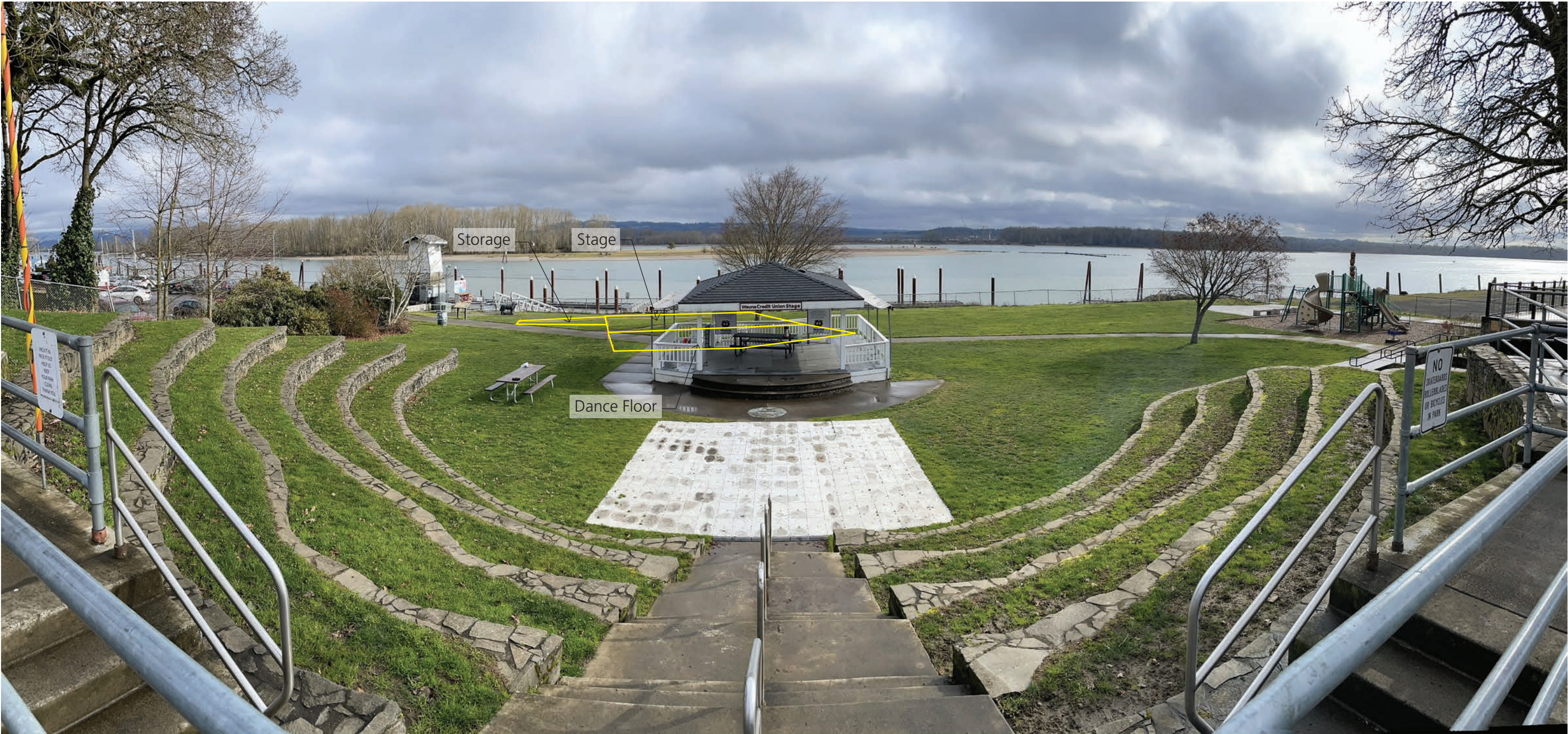
View looking east from top of amphitheater stairs