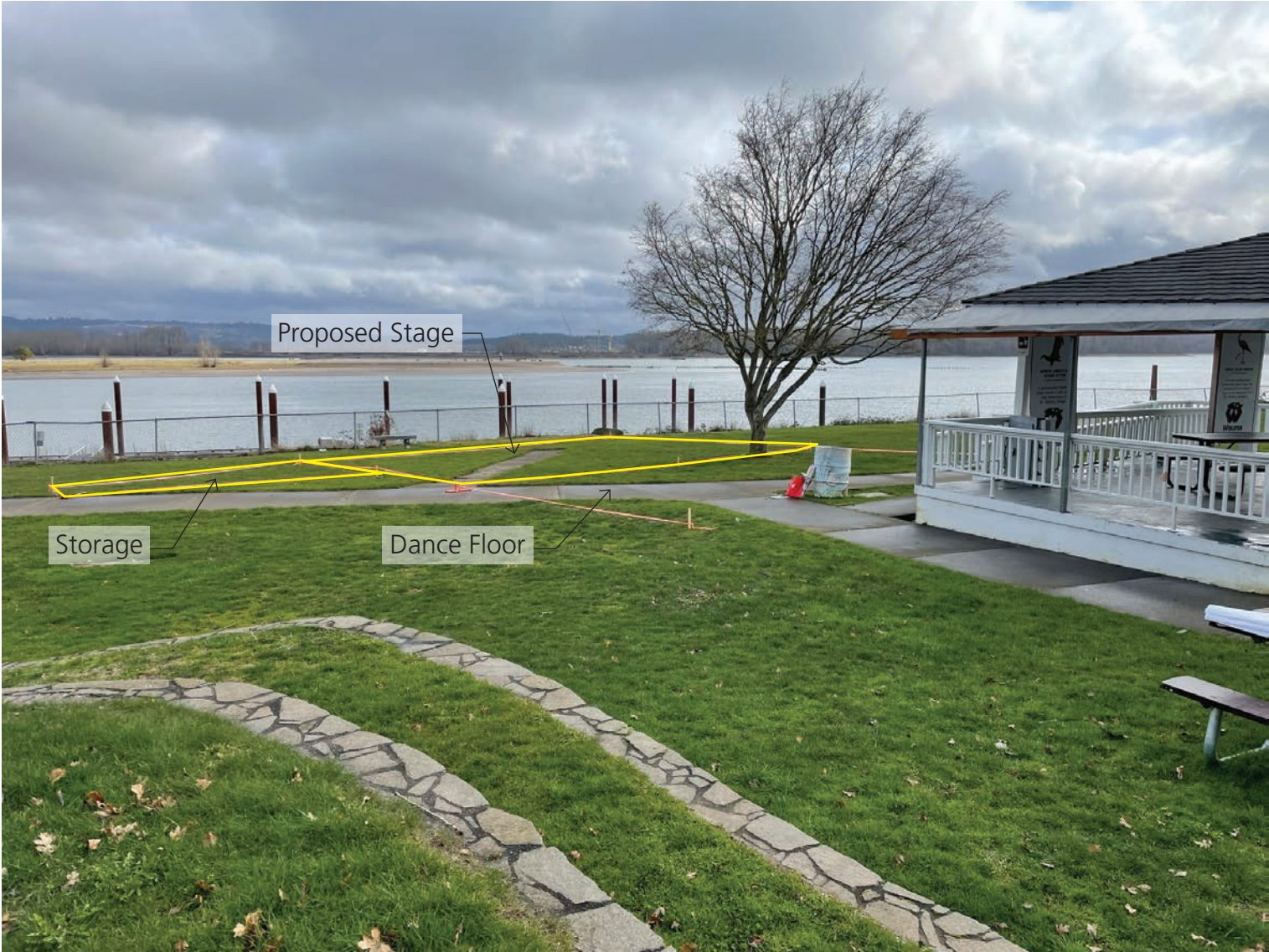
View looking southeast toward proposed stage from amphitheater seats