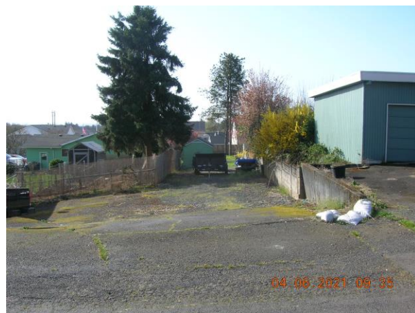
Subject property from Hillcrest Road

North – County Single-Family Residential (R-10) East – City Moderate Residential (R7) South – City General Residential (R5) West – County Single-Family Residential (R-10)