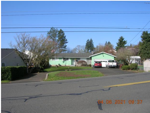
Subject property from North Vernonia Road

The subject property is a 15,246 square foot (0.35 acre) flag lot developed with a detached single-family dwelling. The property abuts N. Vernonia Road with a circular paved driveway approach. The pole portion of the lot accesses Hillcrest Road, but it is not paved and has a detached accessory structure. Although both roads are developed, there are no frontage improvements on either road abutting the property. Vernonia Road, classified as a Collector Road within the City's jurisdiction, has frontage improvements on the opposite side of the property, but none abutting the property. Hillcrest Road is within the County's jurisdiction. The property is currently served by City water, but it is on a private septic system. There is existing access to connect to the City's sanitary sewer system without extending the mainline.