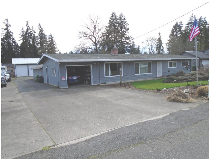
Left: 35262 Fir Street single-family dwelling

The subject property is a rectangular shaped lot at 20,909 square feet or 0.48 acres. The property is developed with a detached single-family dwelling and accessory structures. It is accessed by Fir Street, which is a developed local classified street without frontage improvements (sidewalks, curb, and landscape strip) on either side. The road is within the County's jurisdiction.