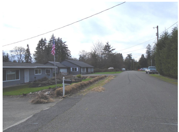
Right: Fir Street right-of-way abutting subject property