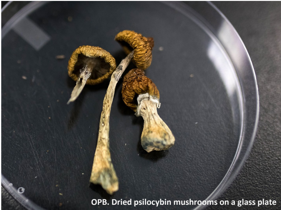
OPB. Dried psilocybin mushrooms on a glass plate