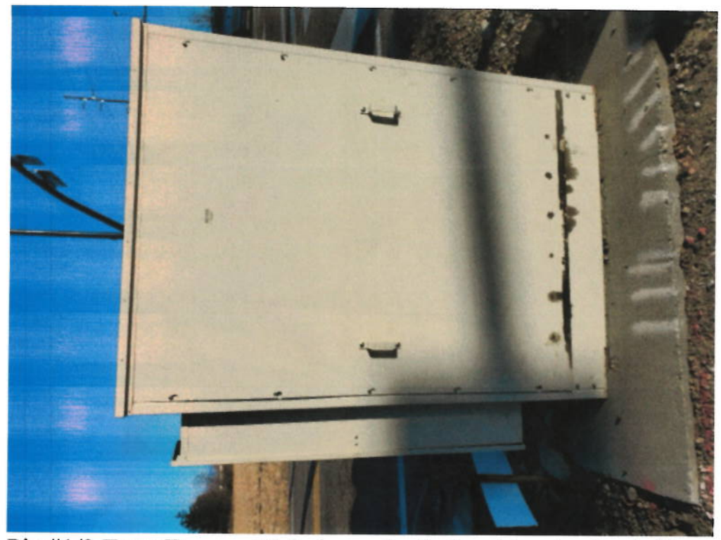
Pic #1/3 Toon Town – Main box – back (next to street outside of sidewalk on Plummer) 67' H x 48' W x 16.5 W (3) pictures of this utility box included