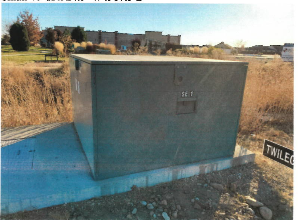
Heron River Large 68' H x 44'W x 27.5' D Small 48' H x 24.5' W x 17.5 D