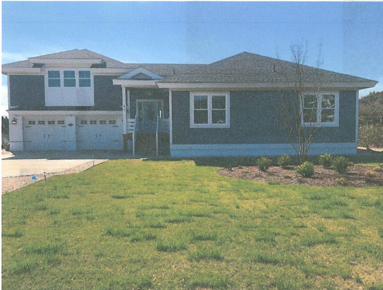
Le Blanc Residence 9 10 th Avenue