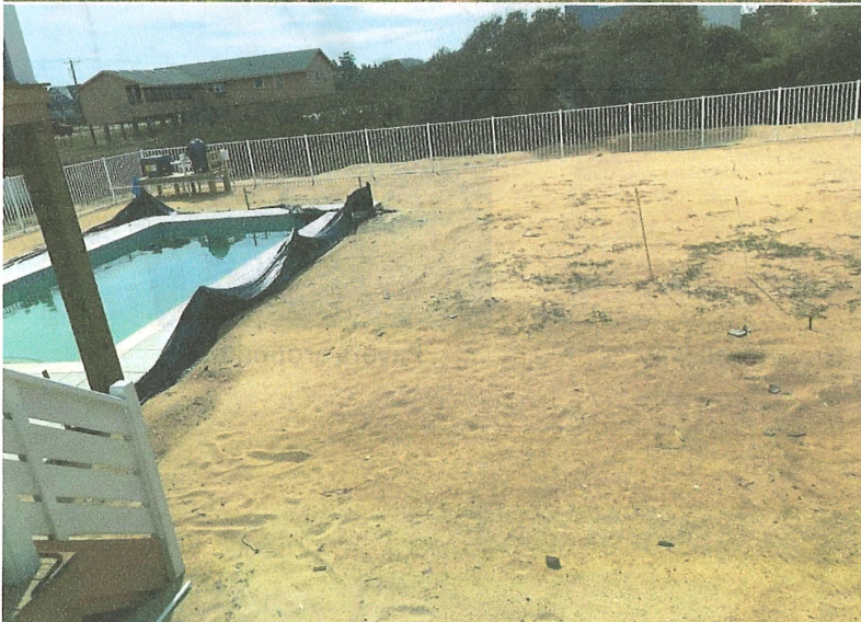
Back Yard before landscaped