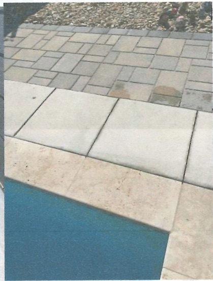
Pavers around pool