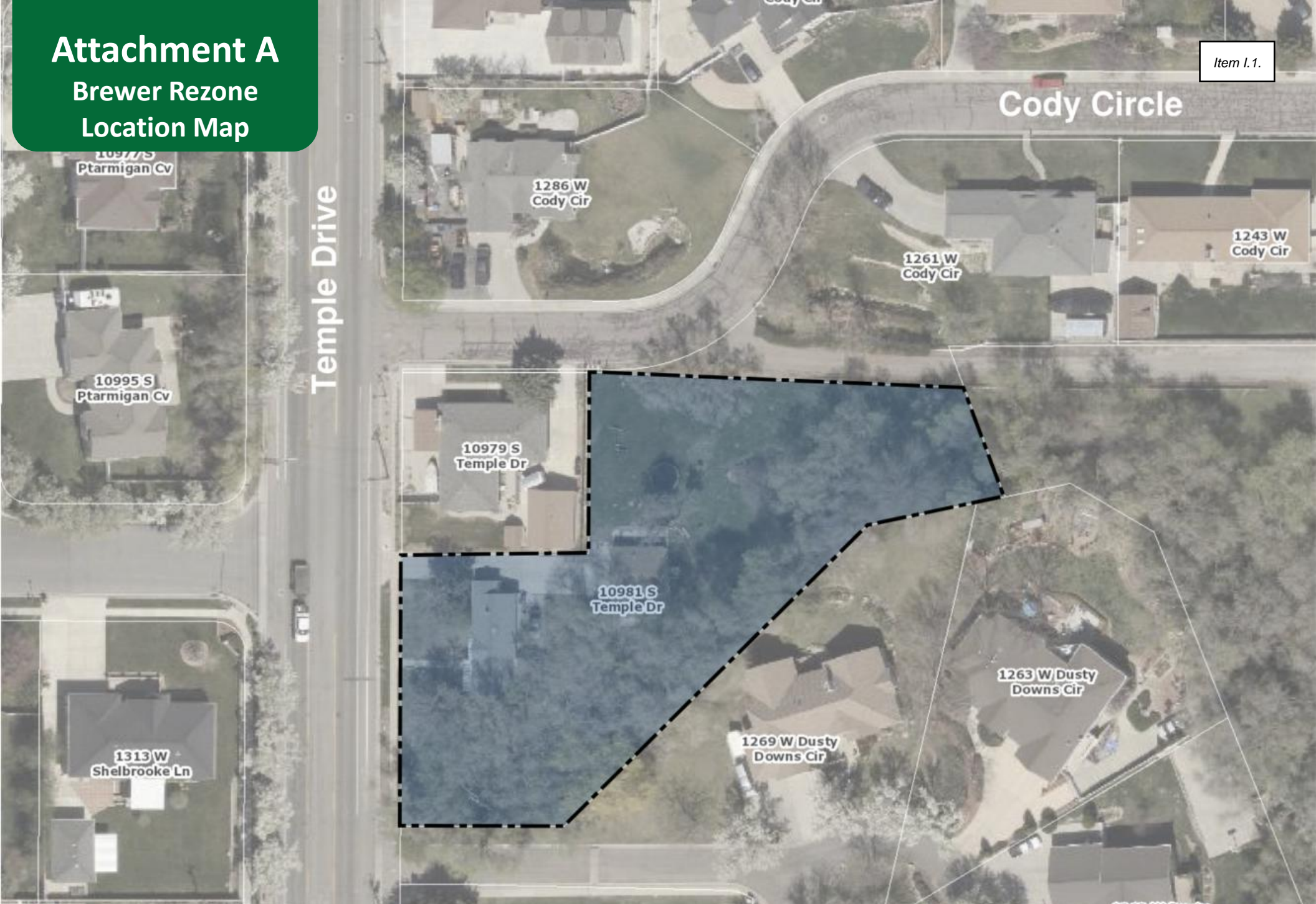
Image Description: The location map depicts the subject property located at 10981 South Temple Drive in South Jordan. The property is outlined in a dashed black outline and highlighted in transparent blue. Nearby streets are Temple Drive and Cody Circle. The maps shows the subject property's size and shape relative to surrounding properties.