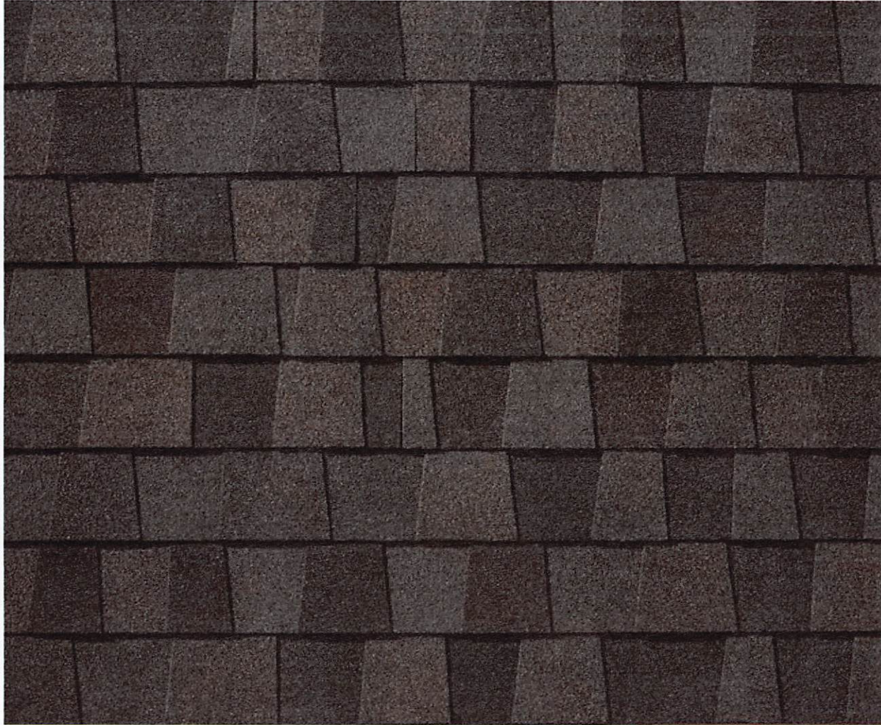
Roof near Appalachian Sky