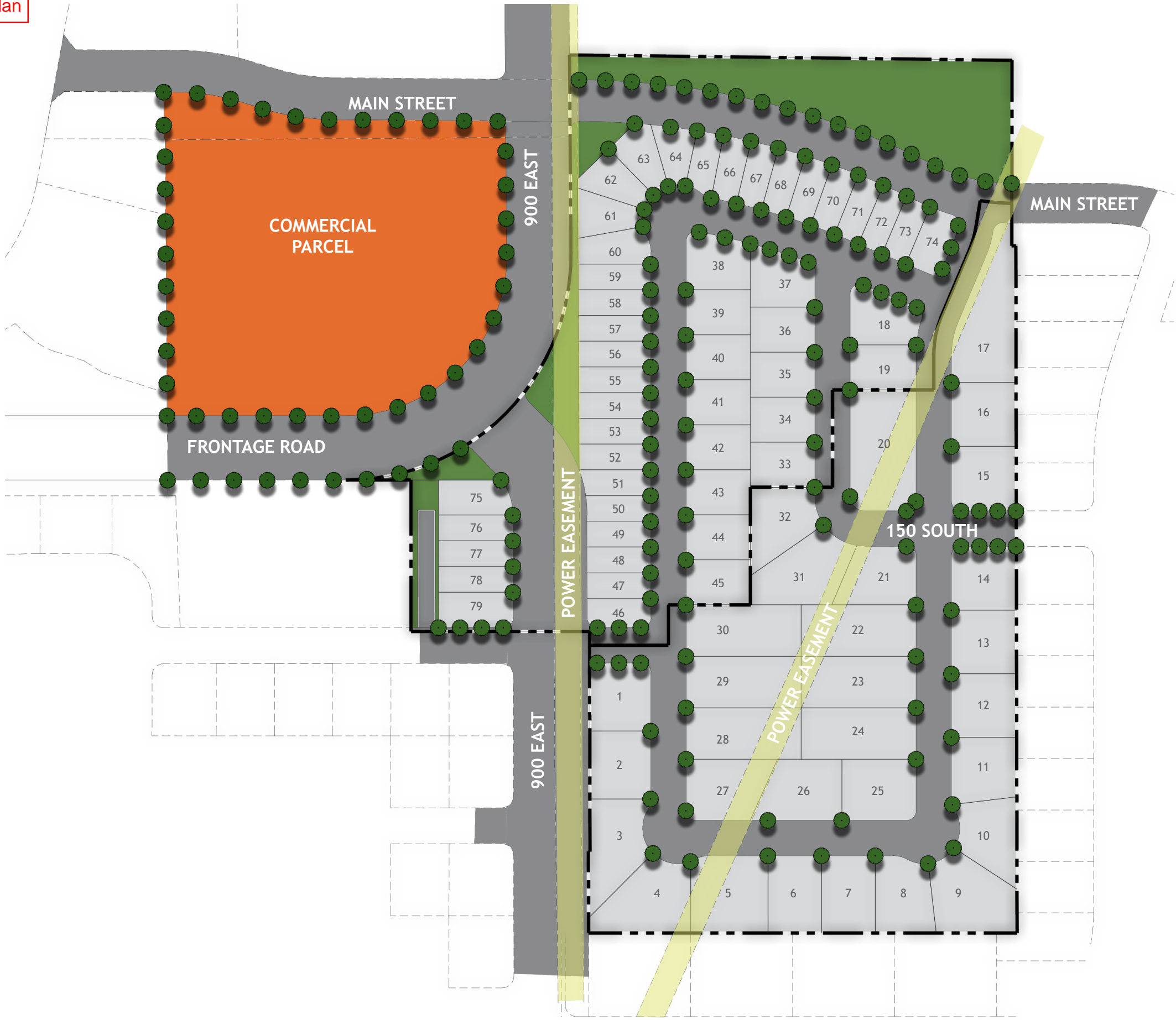
SANTAQUIN ESTATES C o n c e p t P l a n R e n d e r i n g # 2