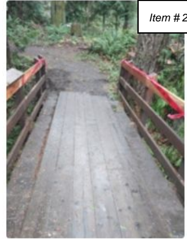
Item # 2.