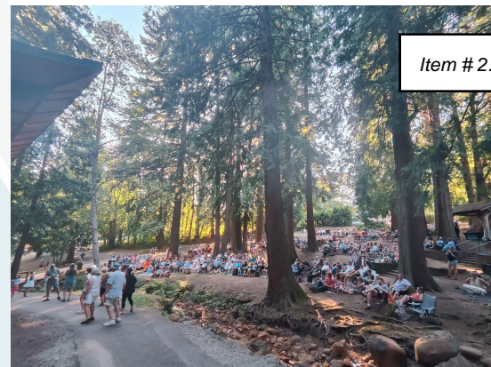
Item # 2.