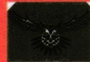
National Anthem by