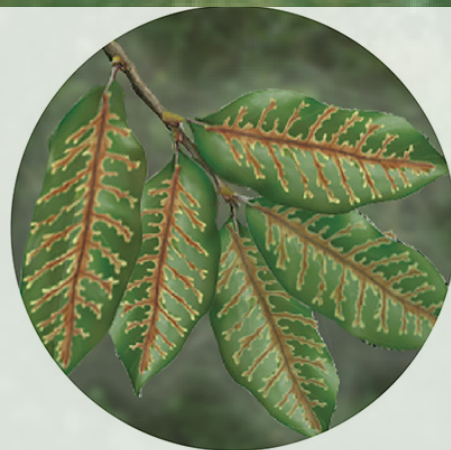
Live oak showing symptoms of oak wilt