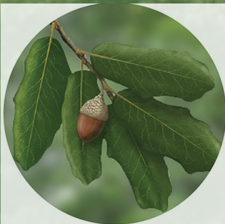
Healthy live oak leaves