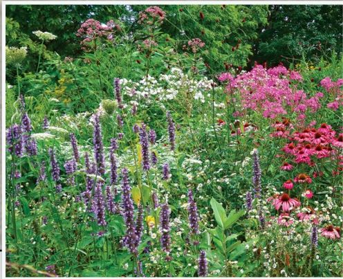
Expanded pollinator garden