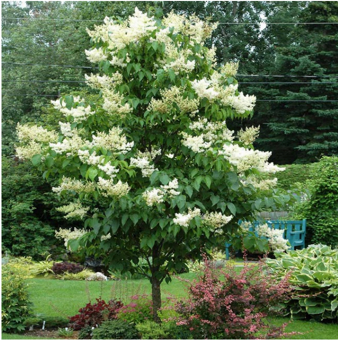
Japanese Tree Lilac

Doesn't spread/sucker, canopy is up, perfect for street/sidewalks, fragrant white blooms in spring,