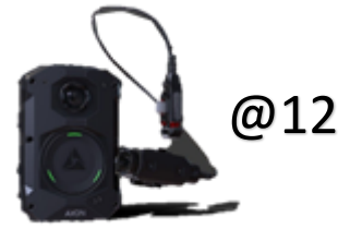
AXON BODY CAMERAS