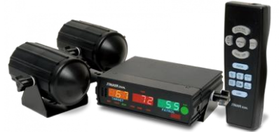
STALKER DUAL SL RADAR